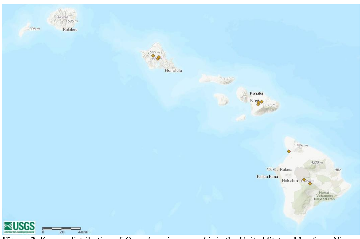
Figure 2 . Known distribution of Oreochromis macrochir in the United States. Map from Nico (2018). All occurrences except the northernmost occurrence on the island of Hawai'i represent established populations and were included in the climate matching analysis.