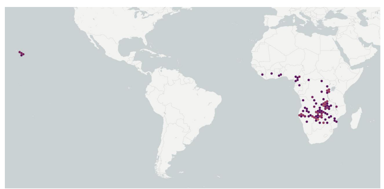
Figure 1 . Known global distribution of Oreochromis macrochir ; reported from Africa and Hawaii. Map from GBIF Secretariat (2019). No georeferenced occurrences were available for parts of the species established range in Swaziland, Burkina Faso, Egypt, Israel, Wallis and Futuna, Madagascar, Mauritius, or Sudan. Occurrences in Burundi, Cameroon, Central African Republic, Gabon, Ghana, Liberia, Mozambique, and Togo do not represent established populations and were not included in the climate matching analysis.