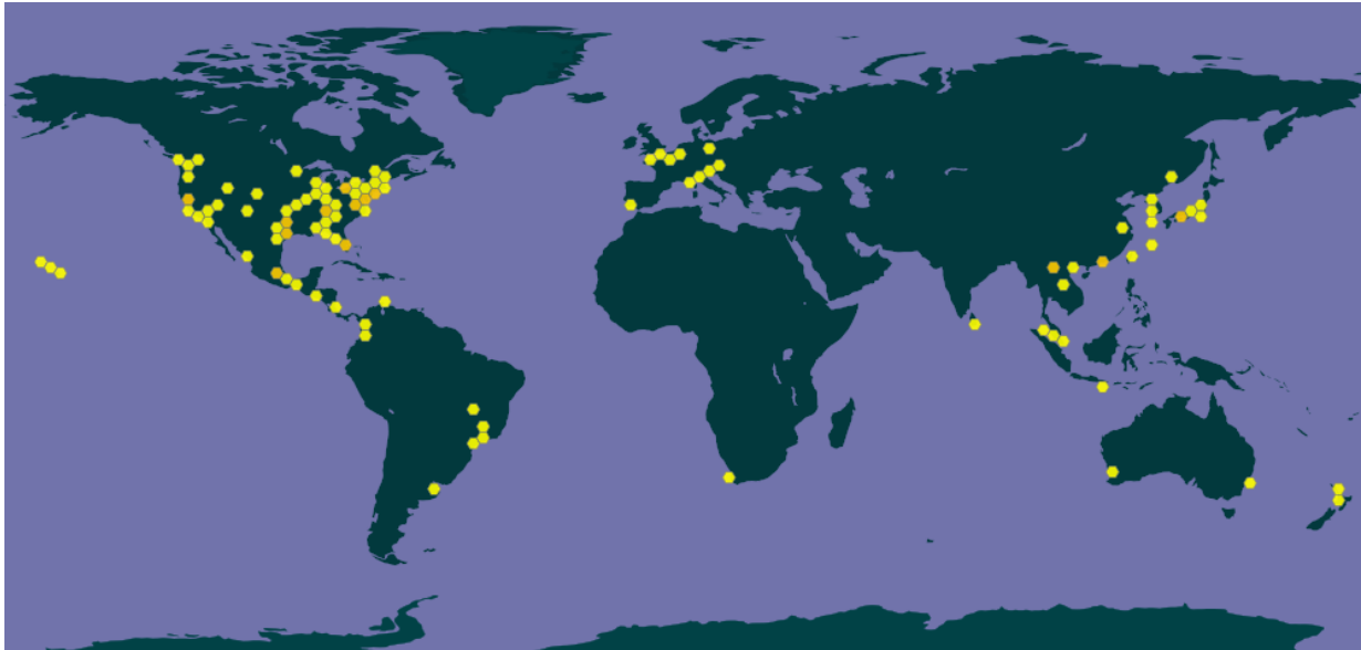
Figure 1. Known global distribution of Cyprinus rubrofuscus . Map from GBIF Secretariat (2019). Most occurrences represent ornamental Koi, not wild-type individuals. It could not be determined which occurrence points represent fish being raised in captivity and which are living in the wild.