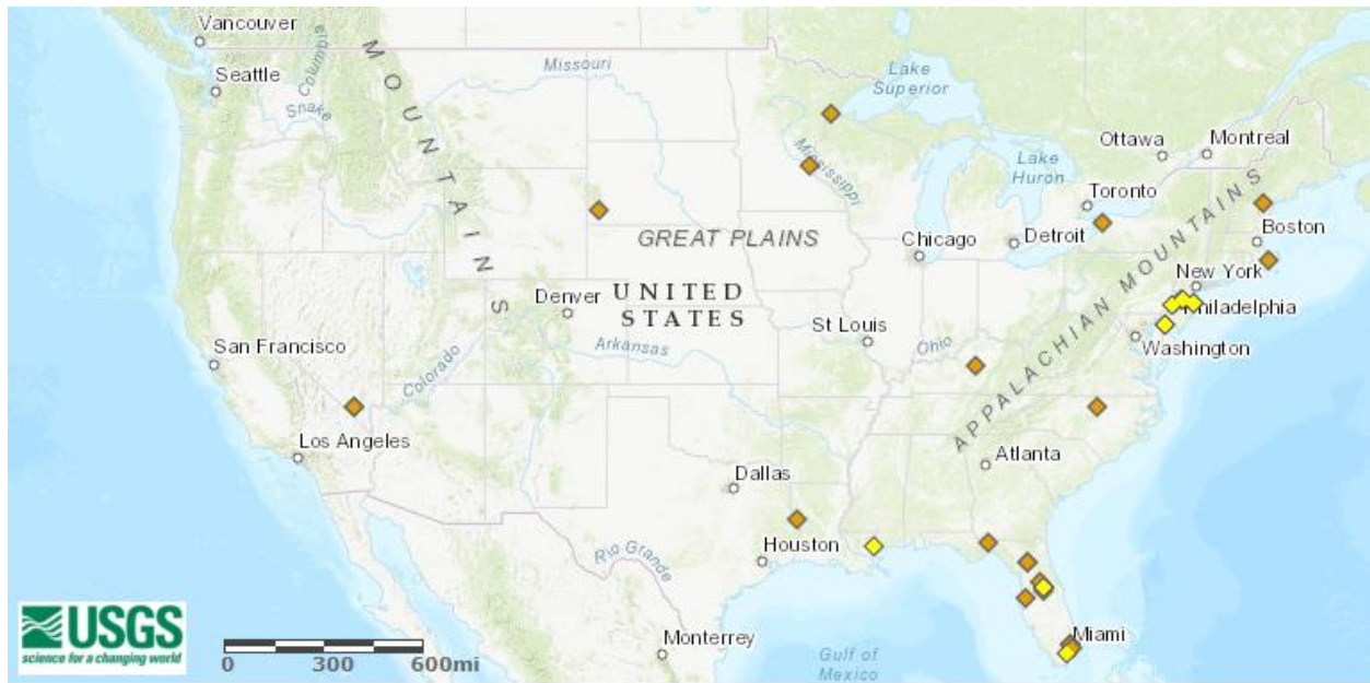
Figure 2. Known distribution of Cyprinus rubrofuscus in the United States. Map from Daniel et al. (2019). Yellow diamonds represent established populations; orange diamonds represent populations with a status of “collected,” “eradicated,” “extirpated,” “failed,” or “unknown.”