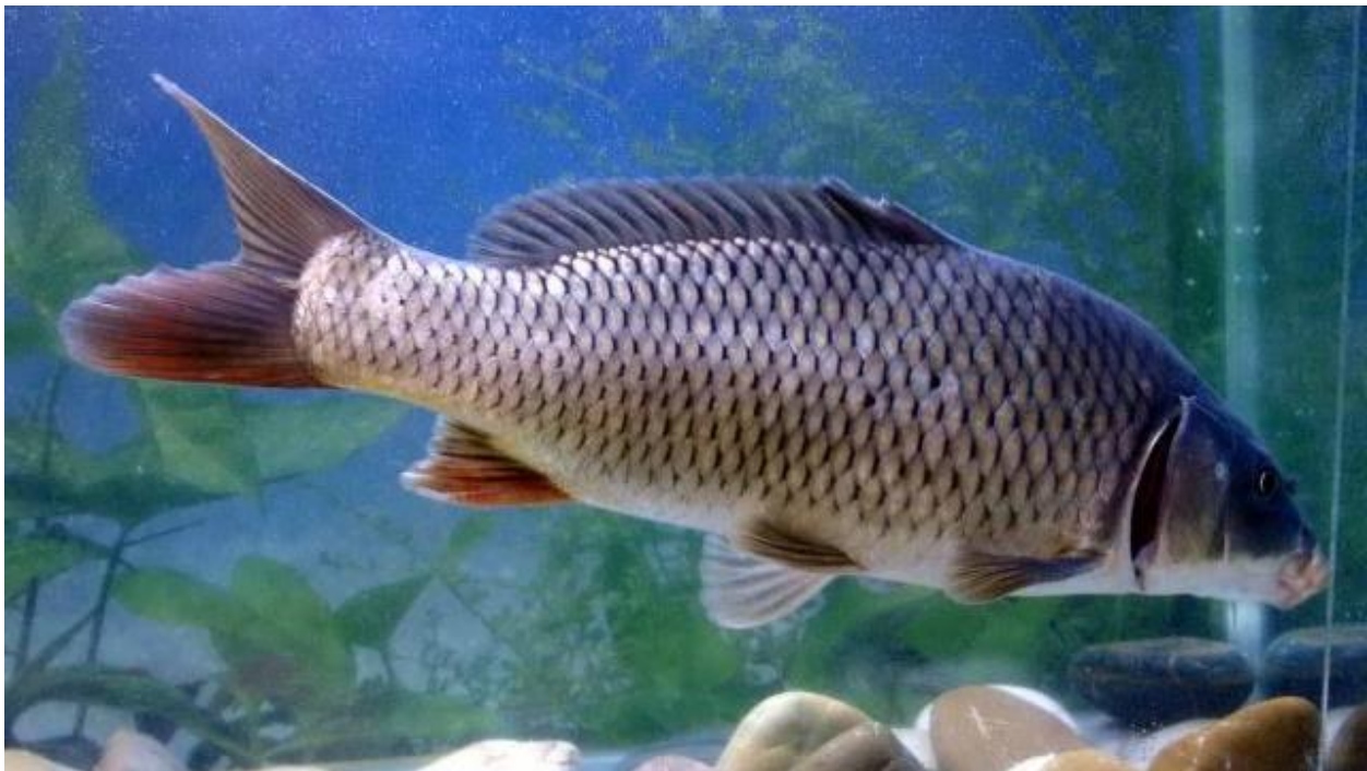
Photo: Chinese Academy of Fishery Sciences. Licensed under CC BY-NC 3.0. Available: https://www.fishbase.de/photos/PicturesSummary.php?ID=59920&what=species . (September 2018).

U.S. Fish and Wildlife Service, September 2011 Revised, September 2019 Web Version, 1/7/2020