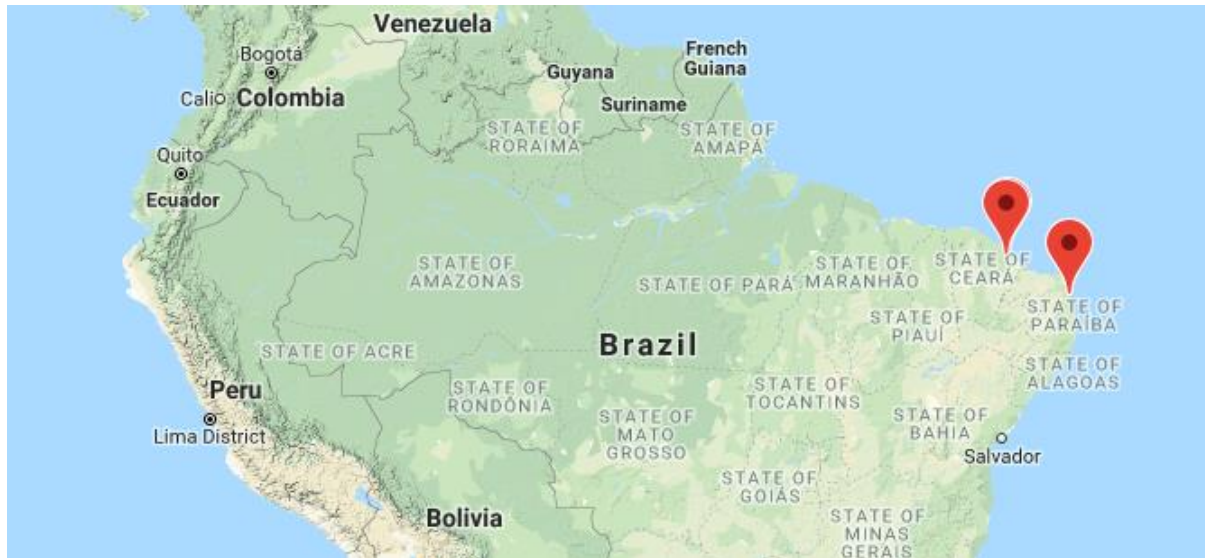
Figure 1. Known global distribution of H. papariae .