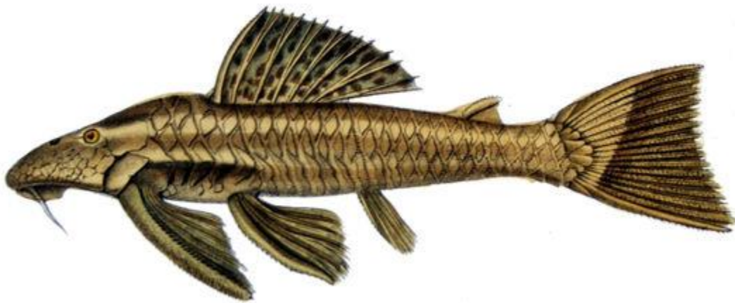
Image: Francis de Laporte de Castelnau. Public domain. Available: http://eol.org/data_objects/27222602 . (September 2018).