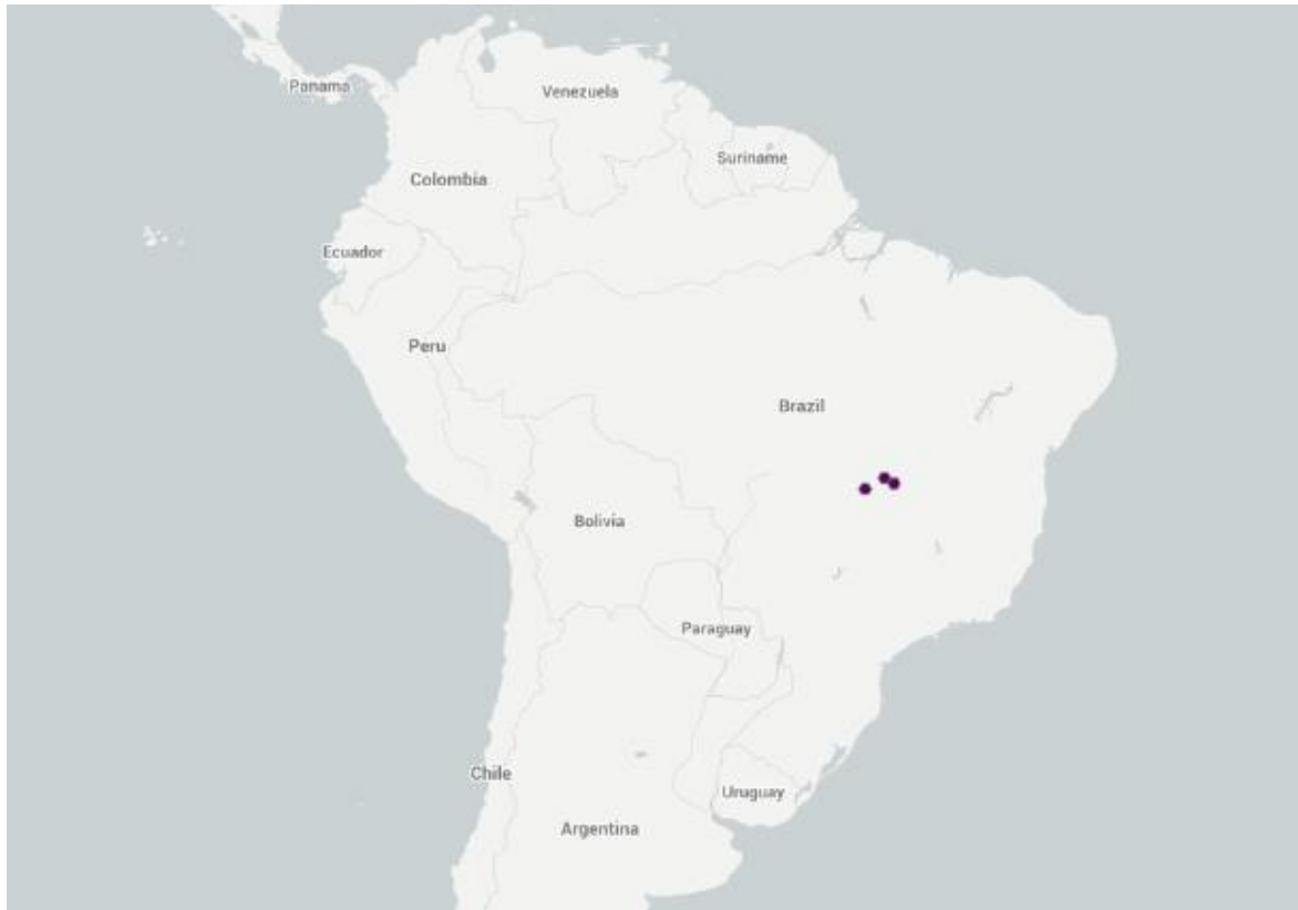
Figure 1. Known global distribution of H. asperatus , reported from Brazil. Map from GBIF Secretariat (2017).