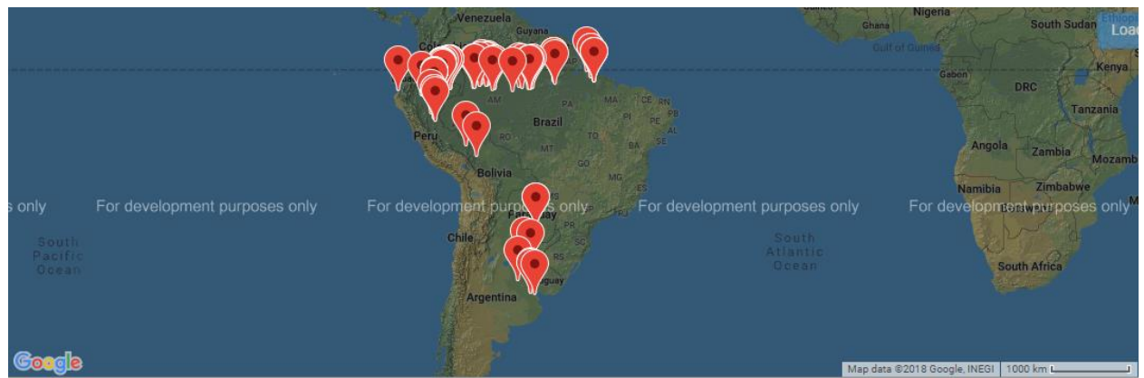
Figure 2. Additional known distribution of Pterodoras granulosus . Additional locations are in Argentina, Peru, and Bolivia. Map from VertNet (2018).

regarding the presence of P. granulosus in the Orinoco basin but no confirmation of presence was found. The location of the Pacific Coast of Peru is outside the described distribution and no other source supported the existence of an established population at that location. The recorded collection locality does not match the given coordinates for the location in the ocean to the east of Brazil.