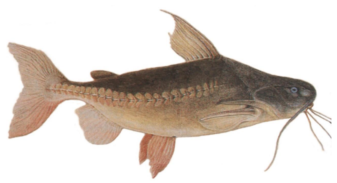
Photo: Johann Natterer. Licensed under Public Domain (created around 1830). Available: https://commons.wikimedia.org/wiki/File:Johann_Natterer_-_Abotoado_(Pterodoras_granulosus).jpg. (December 7, 2018).

U.S. Fish & Wildlife Service, February 2011 Revised, December 2018 Web Version, 1/2/2020