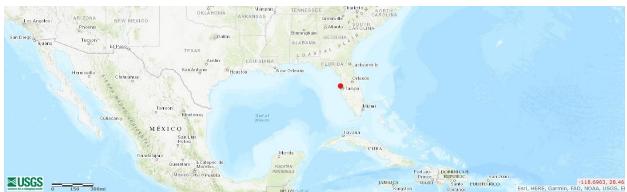
Figure 3 . Location of known introduction of Pterodoras granulosus in the United States, reported from Florida. Map adapted from Nico et al. (2018). The location in Florida was not used to select source points for the climate match. The introduction failed to established a wild population.