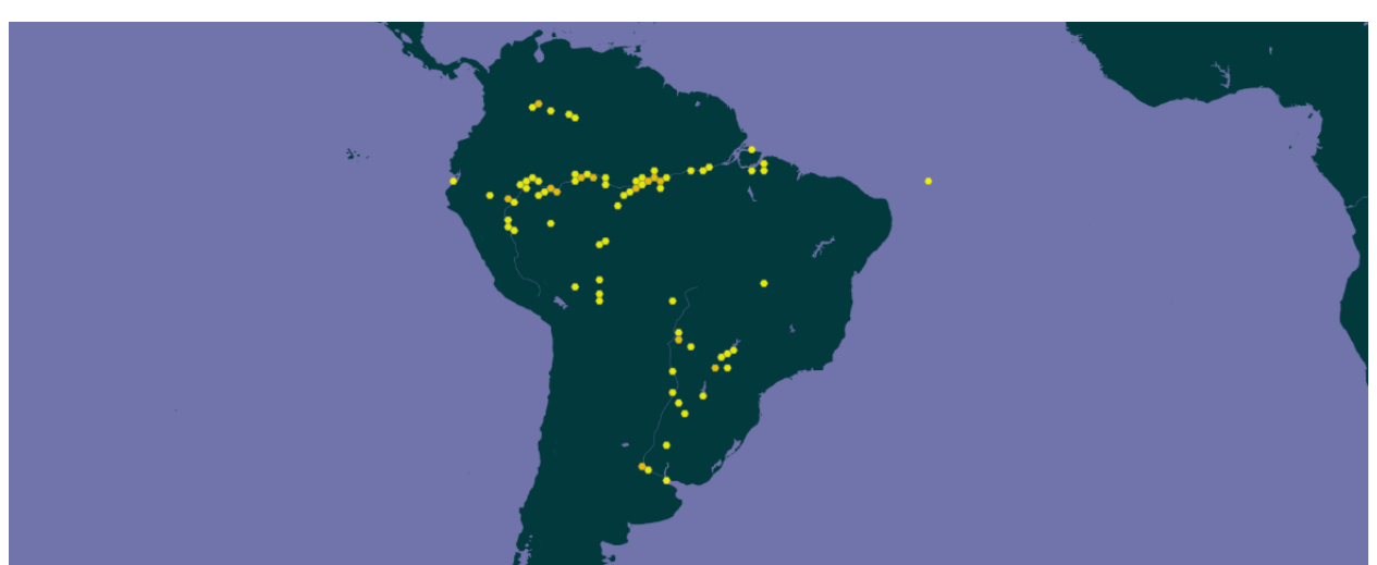
Figure 1 . Known global distribution of Pterodoras granulosus . Locations are in Colombia, Peru, Brazil, Bolivia, Paraguay, Uruguay, and Argentina. Map from GBIF Secretariat (2018). The following observations were not used to select source points for the climate match. The northern cluster of locations (Colombia) were not used to select source points for the climate match. Those locations are all identified as Pterodoras granulosus but are within the Orinoco River Basin, which is outside the described distribution of the species. Information was sought