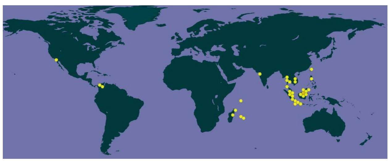
Figure 1 . Known global distribution of Osphronemus goramy . Locations are in India, the United States (California), Colombia, Seychelles, Madagascar, Mauritius, Reunion, Thailand, Laos, Cambodia, Malaysia, Indonesia, Philippines, and Taiwan. Map from GBIF Secretariat (2019). Observations in California, the Seychelles, Reunion, and Taiwan were not used to select source points for the climate match because no established populations have been documented in those locations.

Osphronemus goramy has also been reported as established in New Caledonia, Sri Lanka, Myanmar, and Papua New Guinea but no georeferenced observations were available to use to select source points for the climate match.