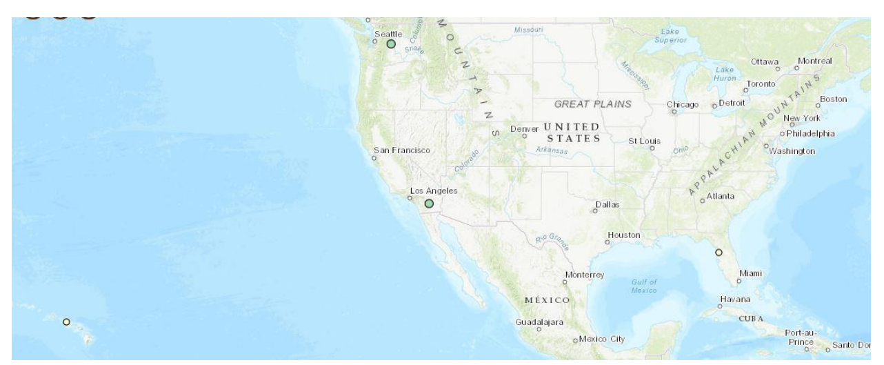
Figure 2 . Reported locations of Osphronemus goramy in the United States. Locations are in southern California, Hawaii, Florida, and Washington. Map from Nico and Neilson (2019). These locations were not used to select source points for the climate match as they do not represent established populations.