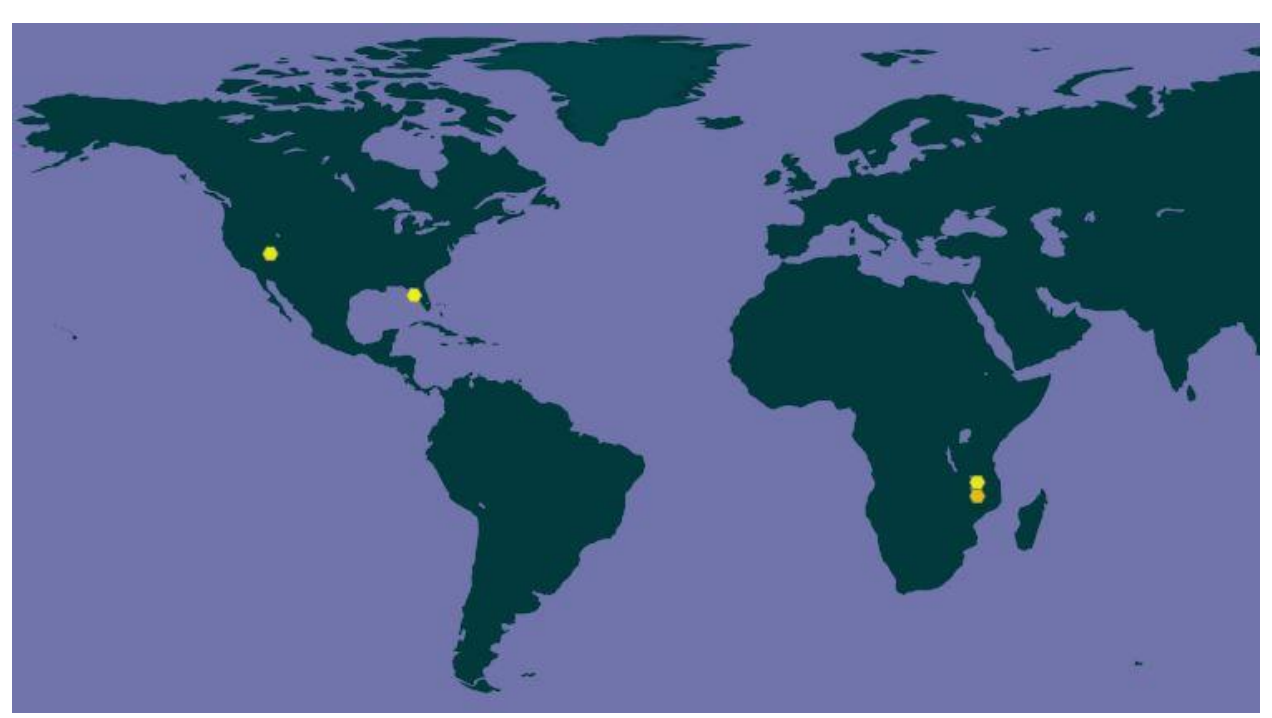
Figure 1 . Known global distribution of Melanochromis auratus . Observations are reported from southeastern Africa and North America. Map from GBIF Secretariat (2019). Locations in the United States do not represent established populations and will not be used to select source locations in the climate match. No georeferenced points were available for Israel, since that is not a self-sustaining population any points would not have been used to select source locations for the climate match.