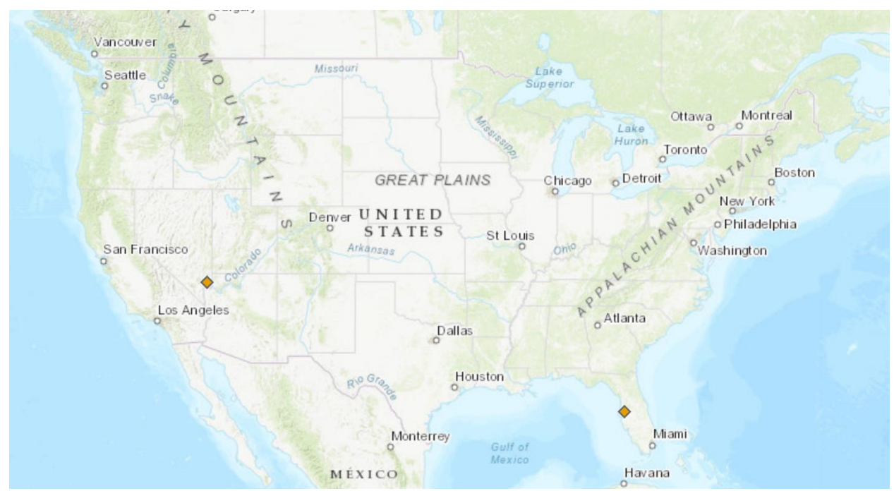
Figure 2 . Known distribution of Melanochromis auratus in the United States in Nevada and Florida. Map from Nico (2019). Locations do not represent established populations and will not be used in the climate match.