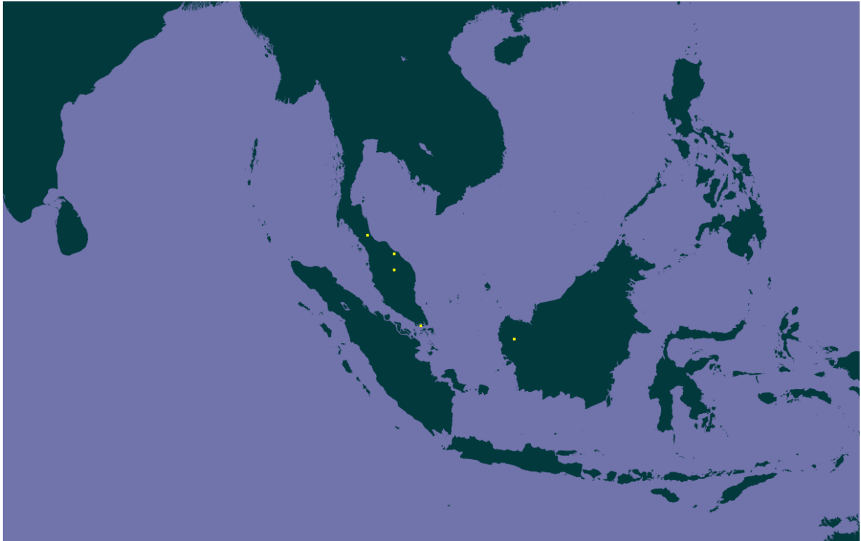
Figure 1. Known global distribution of Desmopuntius pentazona . Map from GBIF Secretariat (2017).