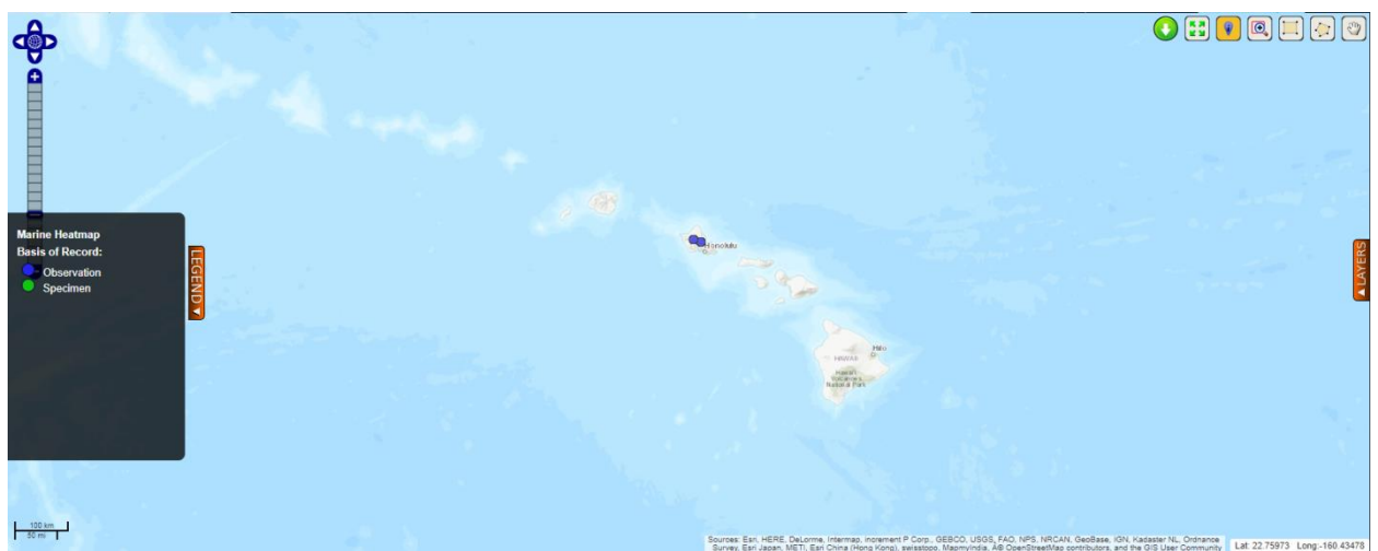
Figure 4. Known distribution of Thorichthys meeki in Hawaii. Map from BISON (2017).

Figure 3. Known distribution of Thorichthys meeki in the contiguous United States and Puerto Rico. Map from BISON (2017). The location in Arizona failed to establish a population and was excluded as a source point in the climate match. Thorichthys meeki was once established in Florida and may still be established, therefore those populations were used as source point for the climate match.