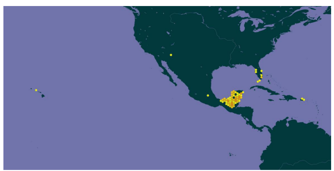
Figure 1. Known global distribution of Thorichthys meeki . Locations are in the United States, Mexico, and Puerto Rico. Map from GBIF Secretariat (2017). The northernmost point in Mexico was an outlier and was not used to select source points in the climate match.