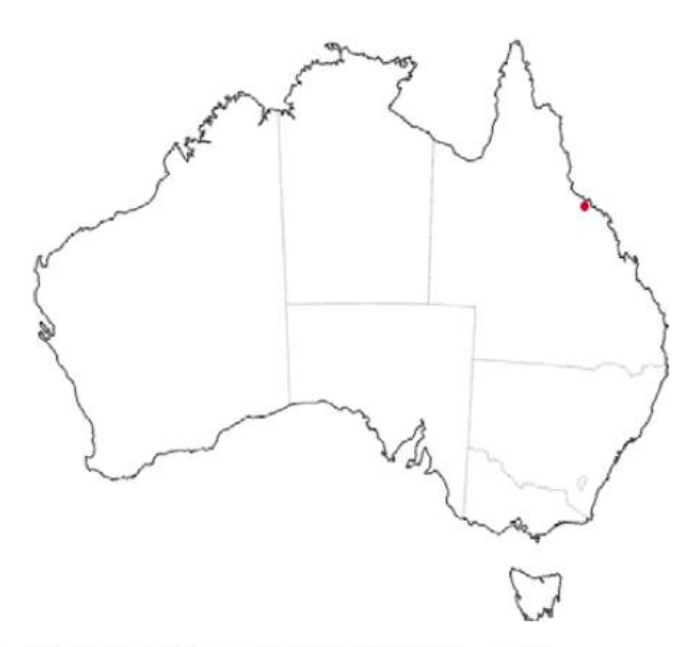
Figure 2.10: Distribution of firemouth cichlid (Thorichthys meeki).

Figure 2. Distribution of Thorichthys meeki in Australia. From Corfield et al. (2007).