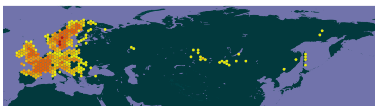
Figure 1. Known global distribution of Phoxinus phoxinus . Map from GBIF Secretariat (2019).