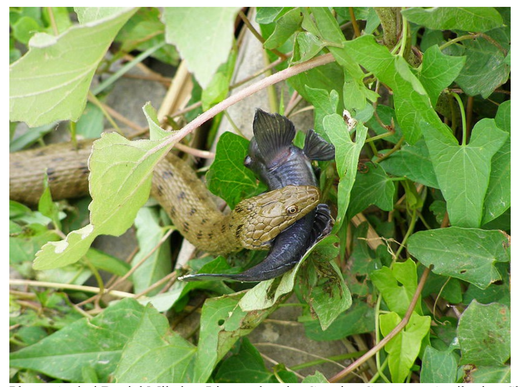
Photo: Andrei Daniel Mihalca. Licensed under Creative Commons Attribution-Share Alike 3.0 Unported. Available:

https://commons.wikimedia.org/wiki/File:Natrix_tessellata_capturing_a_Gobius_fish__20060710.jpg. (January 2022).