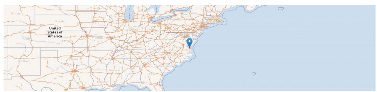
Figure 2. Map of Natrix tessellata observation in the United States. Map from GBIF Secretariat (2022). This location was not used as a source point in the climate match; the introduction did not result in an established population.