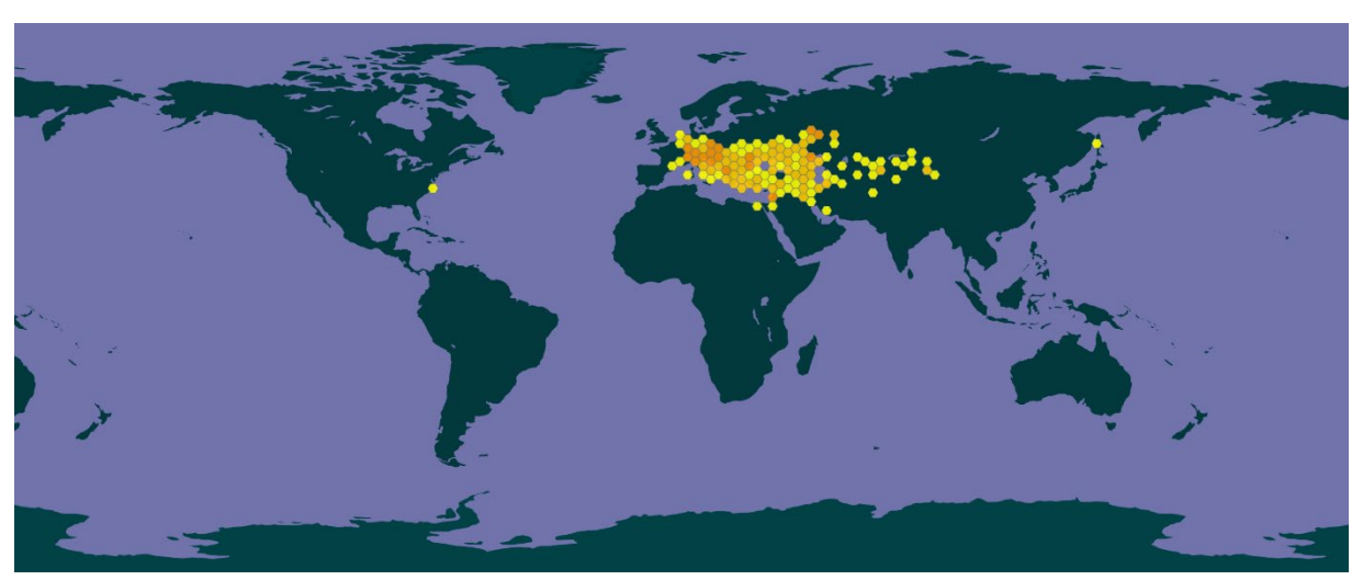
Figure 1. Map of global distribution of Natrix tessellata . Map from GBIF Secretariat (2022). Source points within the United States and Russia were not used in climate match as no evidence of establishment could be found for these areas.