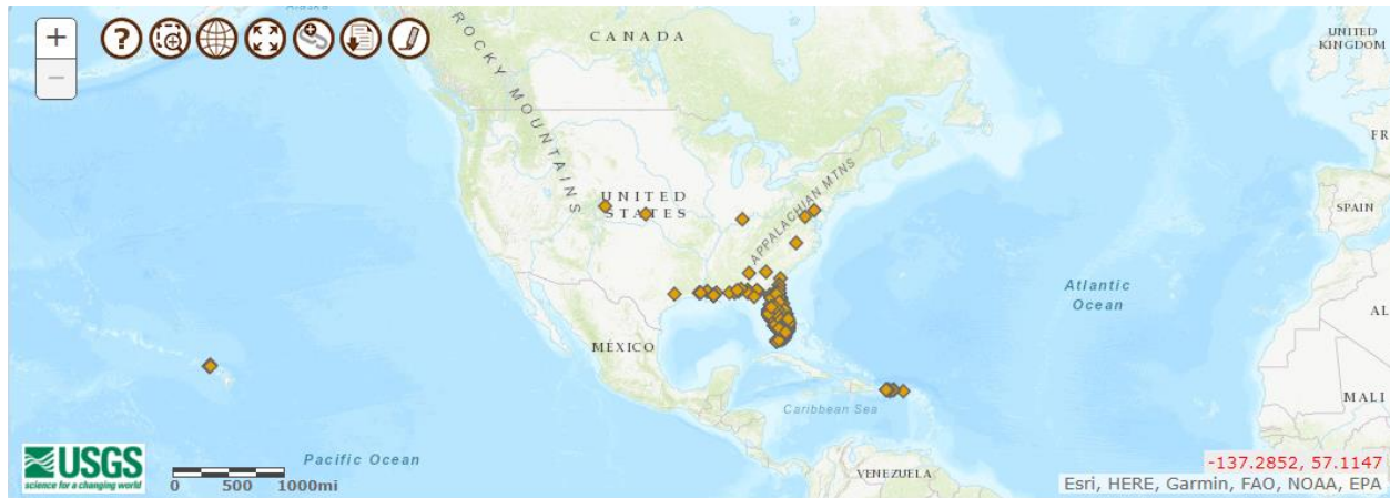
Figure 2. Known distribution of Osteopilus septentrionalis in the United States. Map from Somma et al. (2018).

Points in the contiguous United States that are outside of Florida, and coastal Louisiana were not used in the climate match because they are not representative of wild established populations (Somma et al. 2018). The points in Hawaii were also not used as source points since it is not thought that the species is established in Hawaii (Somma et al. 2018).