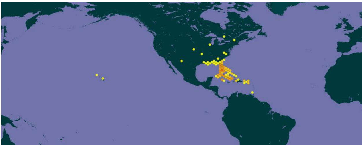
Figure 1. Known global distribution of O. septentrionalis . Map from GBIF Secretariat (2018).