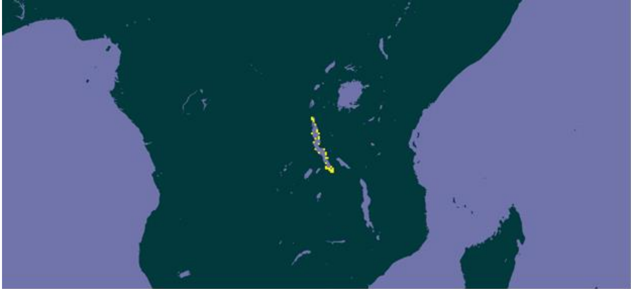
Figure 1. Known global distribution of Altolamprologus compressiceps . Locations are in Burundi, Democratic Republic of Congo, Tanzania, and Zambia. Map from GBIF Secretariat (2017).