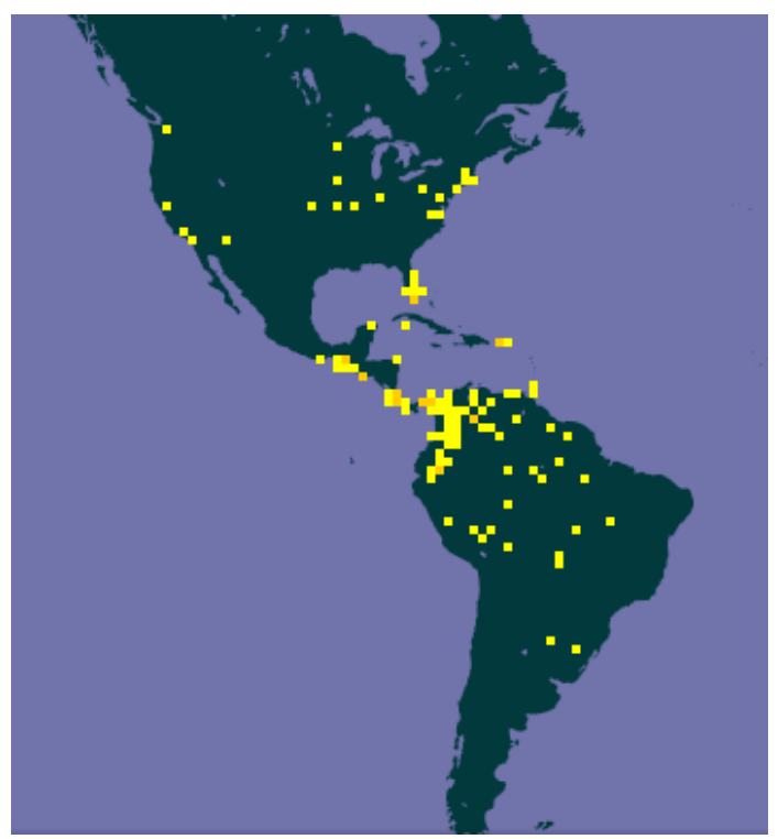
Figure 1. Known global distribution of Caiman crocodilus , reported in North and South America. Map from GBIF (2016). Locations in the United States outside of Florida and Puerto Rico do not represent established populations and were omitted from climate matching.