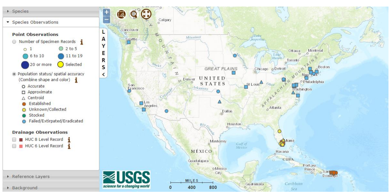
Figure 2. Distribution of C. crocodilus in the United States. Map from Somma and Fuller (2016).