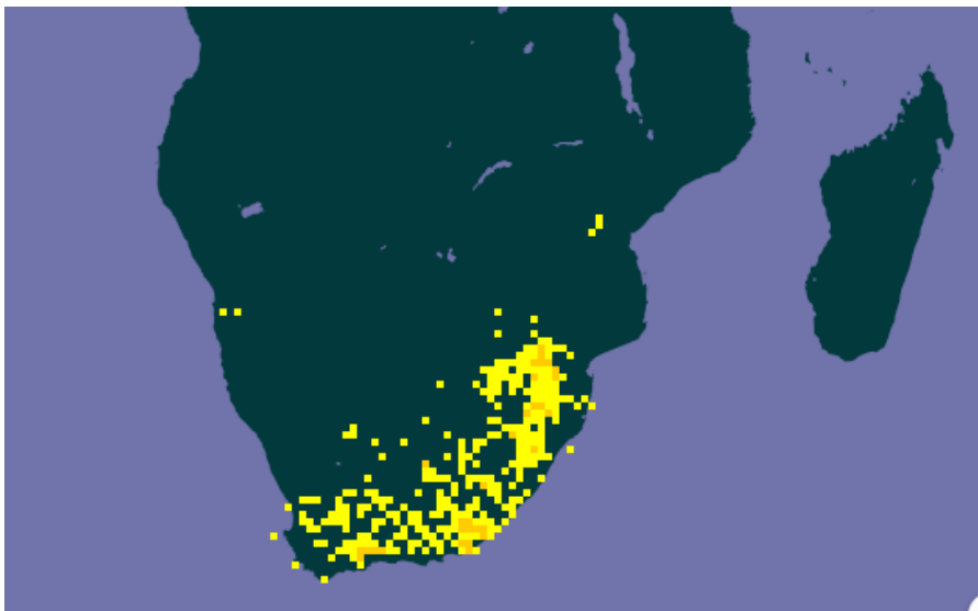
Figure 1. Known global established locations of Enteromius anoplus in South Africa, Lesotho, Swaziland, and Namibia (GBIF 2016). Points in Mozambique were not used in climate matching because of inaccurate location.