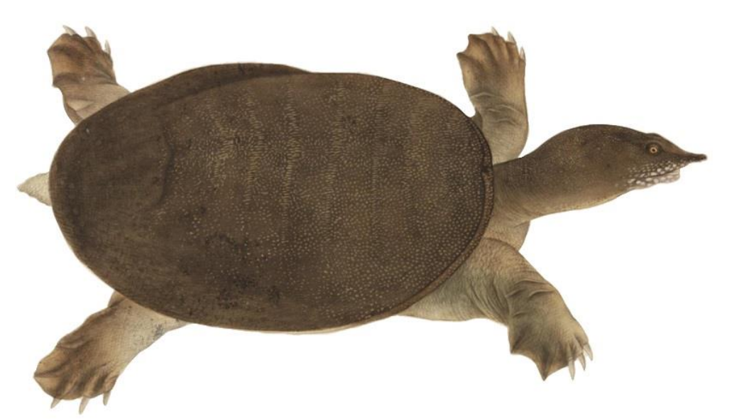
Image: Kawahara Keiga, via Naturalis Biodiversity Center. Public domain. Available: https://commons.wikimedia.org/w/index.php?curid=52434180. (January 2017).

U.S. Fish & Wildlife Service, August 2016 Revised, January 2017 Web Version, 4/2/2018