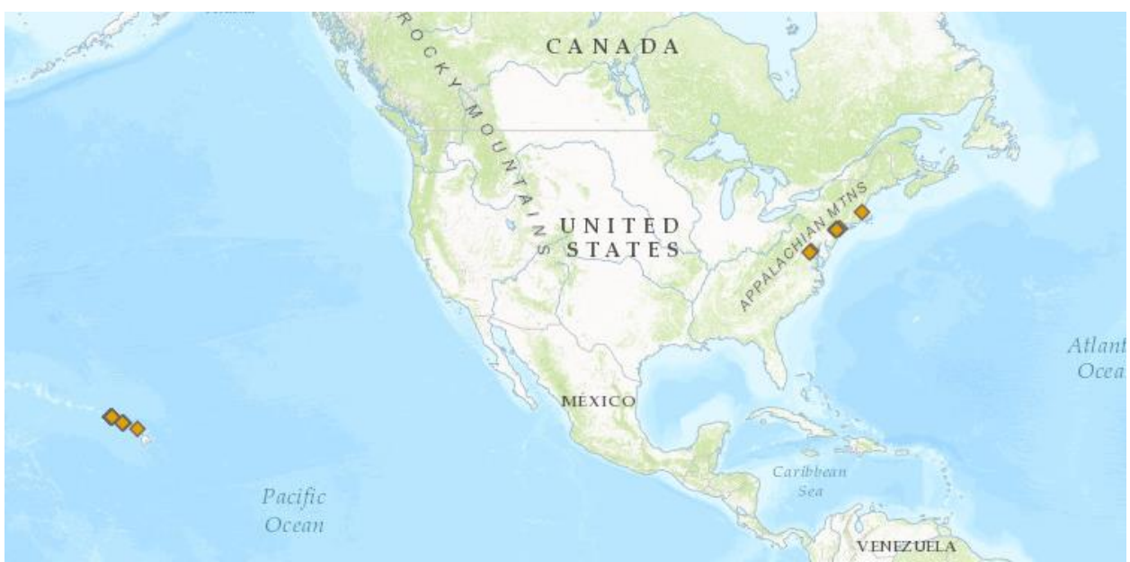
Figure 2. Known distribution of Pelodiscus sinensis in the United States. Map from Somma (2016). Only points in Hawaii represent established populations; all other points were excluded from climate matching.