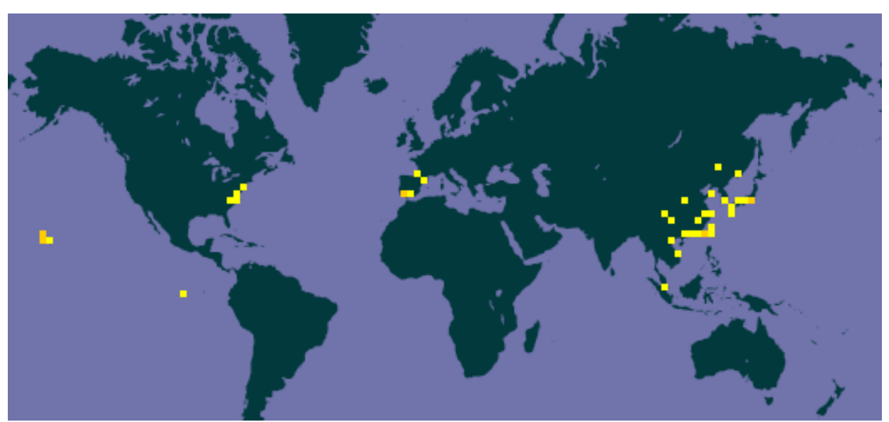
Figure 1. Known global distribution of Pelodiscus sinensis . Map from GBIF (2016). Points on the eastern coast of the U.S., northern Spain, and in the Pacific Ocean off South America were excluded from climate matching because they do not represent established populations. Points in northern China and on the Korean Peninsula were also excluded from climate matching based on recent taxonomic work (see Remarks, above).