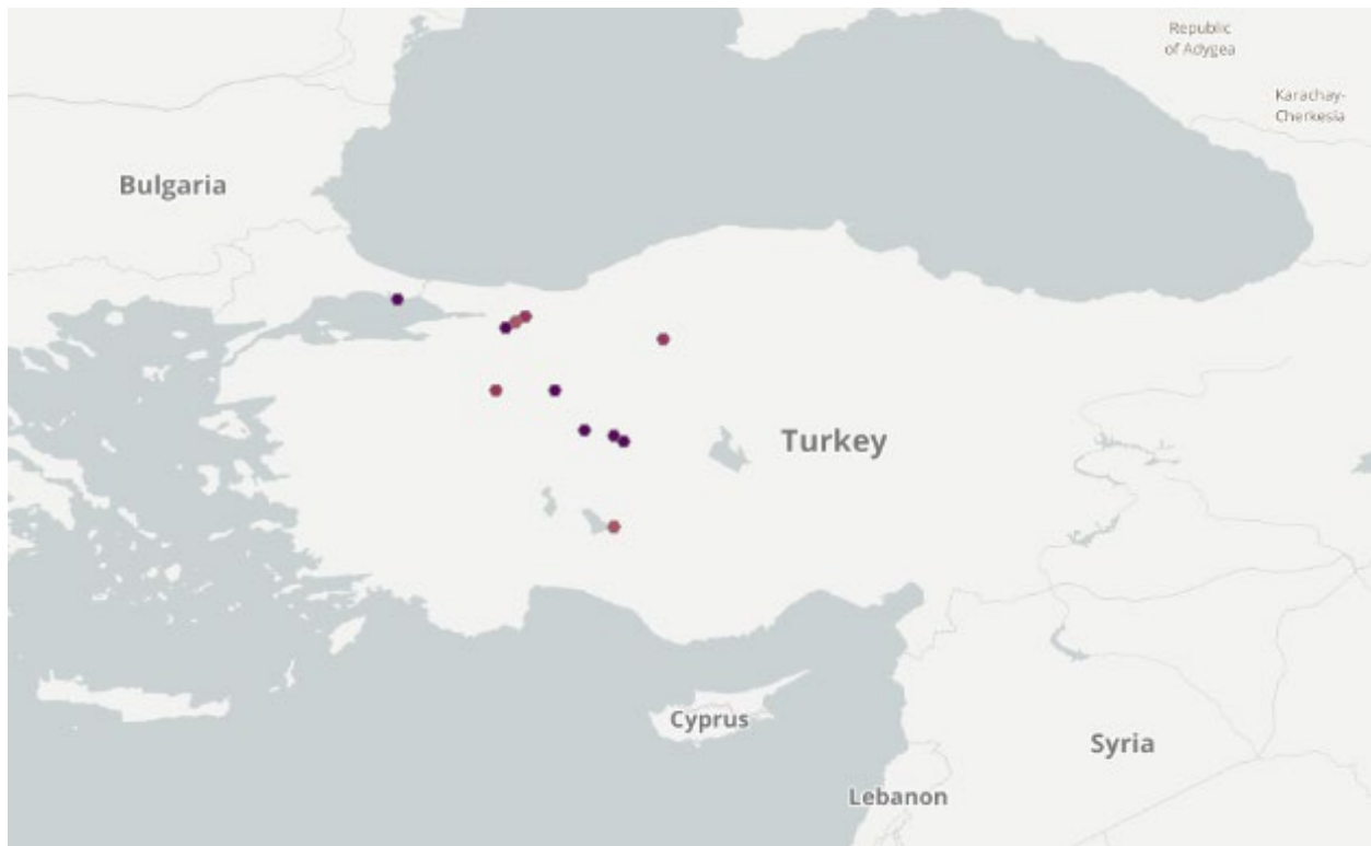
Figure 1. Known global distribution of Alburnus escherichii . Observations are reported from the Sakarya and Kizilirmak river basins and the Lake Beyşehir basin in western Turkey. Map from GBIF Secretariat (2022). A single occurrence in the vicinity of Istanbul was reported without precise coordinates (GBIF Secretariat 2022) and is not known to represent an established population, so it was excluded from the climate matching analysis.