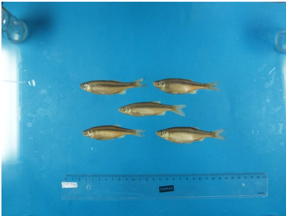
Licensed under Creative Commons BY-SA 4.0. Available: https://www.gbif.org/occurrence/3774875794 (September 2022).

Overall Risk Assessment Category: Uncertain