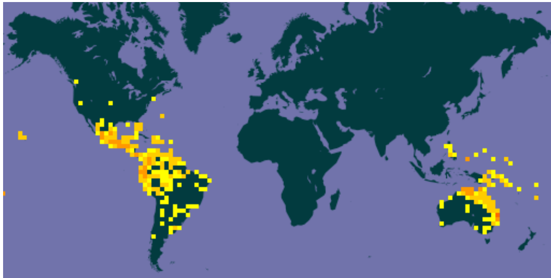
Figure 1. Known global distribution of R. marina . Map from GBIF (2015). Locations in Canada and the northern U.S. were not included in the climate matching analysis because they do not represent established populations of R. marina .