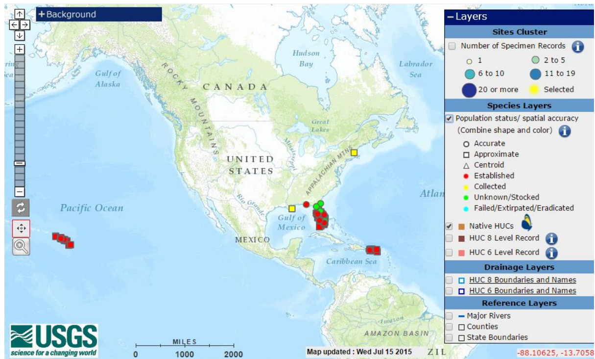
Figure 2. U.S. distribution of R. marina . Map from Somma (2015).