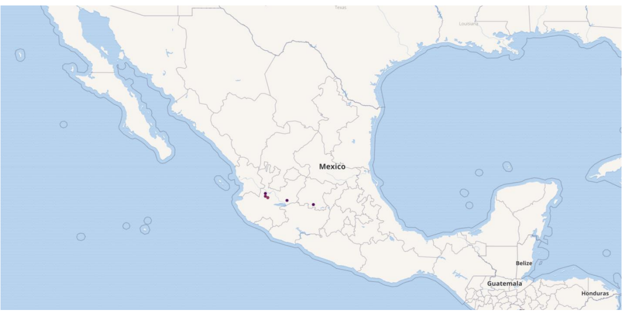
Figure 1. Global distribution of Ameca splendens . A point in Thailand was removed because its location is believed to be incorrect. Map from GBIF Secretariat (2017).