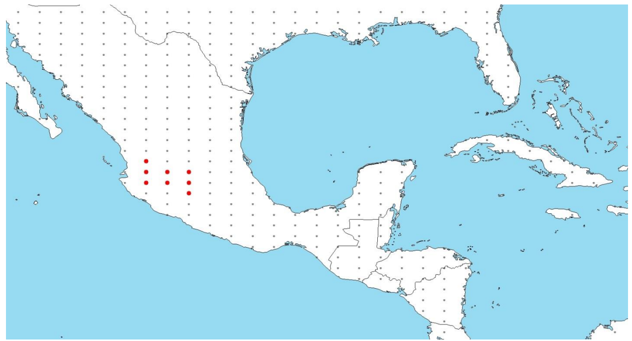
Figure 2 . RAMP (Sanders et al. 2014) source map showing weather stations selected as source locations (red; Mexico) and non-source locations (gray) for A. splendens climate matching. Source locations from GBIF Secretariat (2017). A point in Thailand was removed because it is believed to be incorrectly located.

coastal California, and peninsular Florida all showed medium match. The remainder of the contiguous United States had a low match.