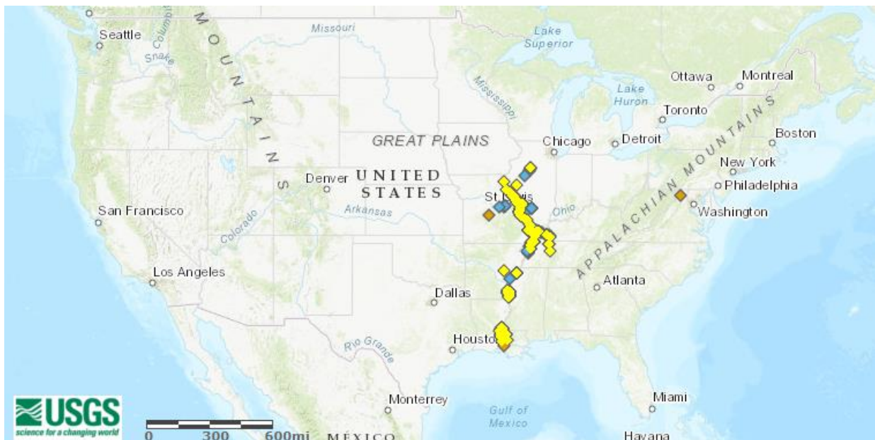
Figure 2. Known distribution of Mylopharyngodon piceus in the United States. Yellow points represent confirmed established locations; blue and orange points represent locations where introductions have failed or status is unknown. Only established locations were used in the climate matching analysis. Map from Nico and Neilson (2019).