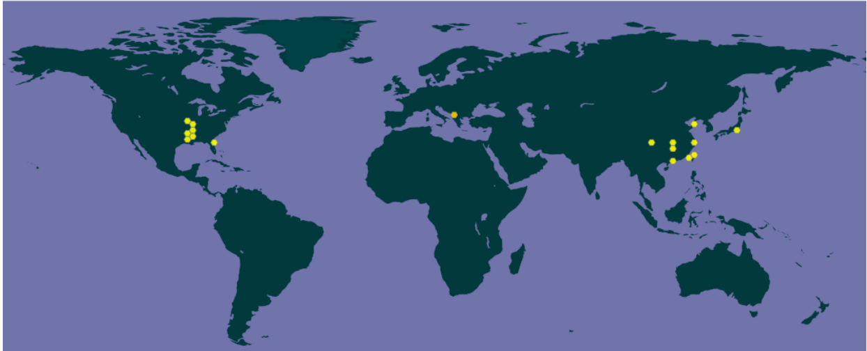
Figure 1. Reported global distribution of Mylopharyngodon piceus , recorded in eastern Asia (China, Japan, and Taiwan), Europe (Montenegro) and the United States. Map from GBIF Secretariat (2019). Points in Florida (United States) and Montenegro were excluded from the climate matching analysis because establishment is not confirmed in these locations.