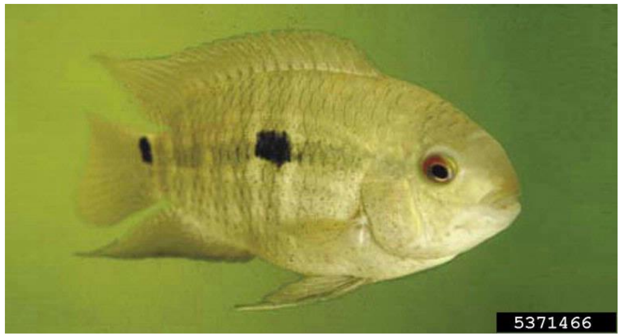
Photo: Florida Fish and Wildlife Conservation Commission. Licensed under Creative Commons (CC BY-NC). Available: https://www.invasive.org/browse/detail.cfm?imgnum=5371466. (January 2018).

U.S. Fish & Wildlife Service, February 2011 Revised, August 2014 and January 2018 Web Version, 4/5/2018