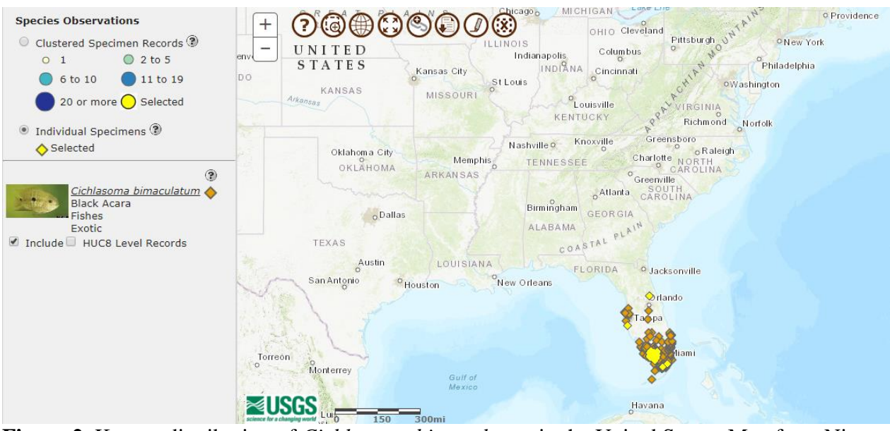
Figure 2. Known distribution of Cichlasoma bimaculatum in the United States. Map from Nico et al. (2018). Orange points represent established populations; yellow points represent collection locations where establishment is uncertain.