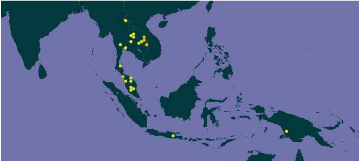
Figure 1. Known global established locations of Anentome helena , reported from Southeast Asia. Map from GBIF Secretariat (2017). The location on the island of New Guinea is the result of a coordinate error, so this occurrence was excluded from the climate matching analysis.