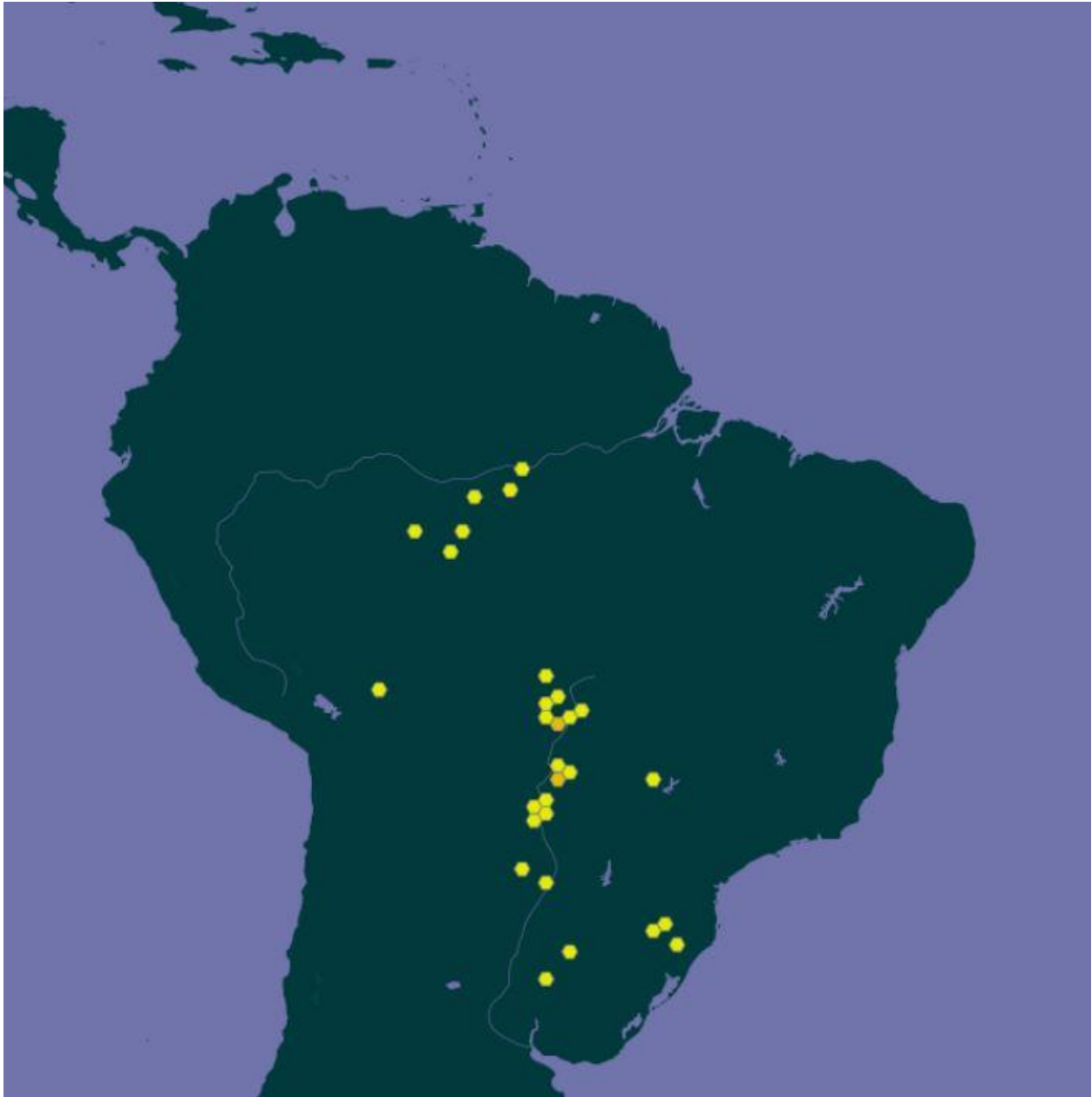
Figure 1. Map of known global distribution of Acestrorhynchus pantaneiro , reported from South America. Map from GBIF Secretariat (2017).