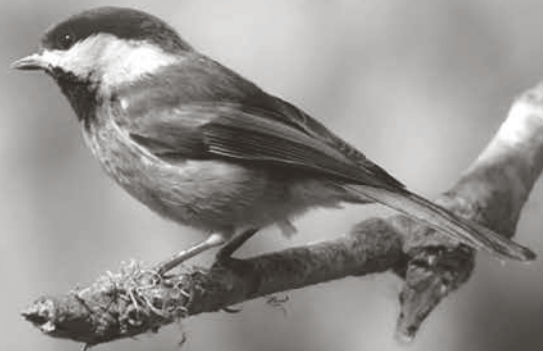
Chestnut-backed chickadee ©Alan Vernon