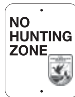
No Hunting Zone

This sign delineates the refuge boundary