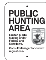
Public Hunting Area

This area is open to public hunting, according to the regulations in this brochure