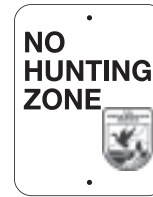
No Hunting Zone

This sign delineates the refuge boundary