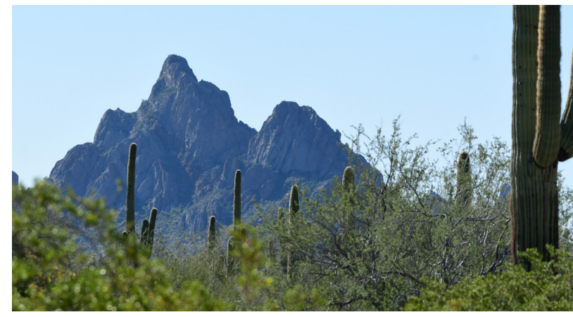
A trip down Charlie Bell Road offers stunning views of the Growler Mountains. Keep a lookout for wildife. You may catch a glimpse of Sonoran Desert residents such as coyote, kit fox, and desert bighorn sheep.