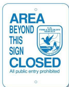
Closed Area Sign , all entry prohibited.

See Delaware Bay Division and Great Cedar Swamp Division maps for areas open for hunting.