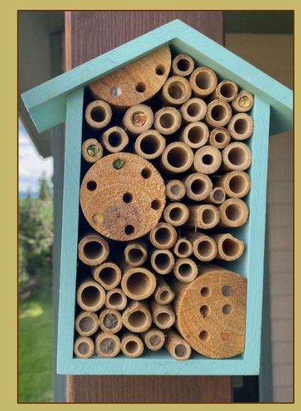
A bee box adjacent to our pollinator garden.

Just one part of the amazing pollinator garden at the BFHC, filled with a careful selection of native and nonnative plants.