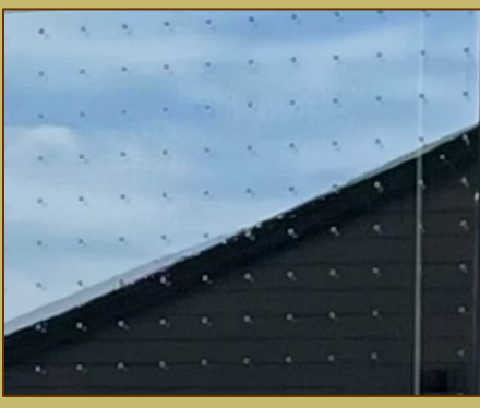
Close-up photograph of a BFHC office window with bird strike film installed. Stickers are 2-inches apart.