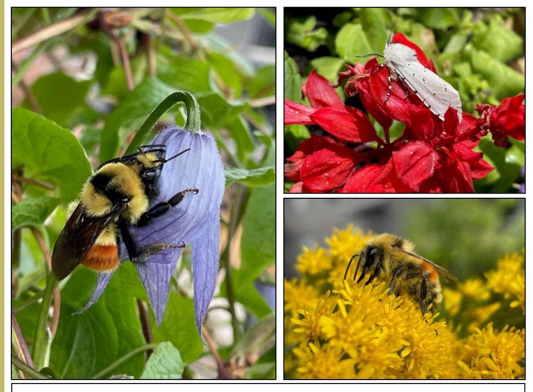
A collection of various pollinating species that have visited our flower beds this summer.