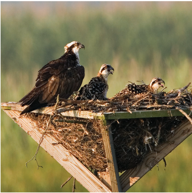
Osprey in nesting platform

along the forest edge. Sika deer, a species native to Asia that were introduced to nearby James Island in 1916, prefer the wet woodlands and marsh. Sika deer are more nocturnal than white-tailed deer and, therefore, are less likely to be seen. Both gray squirrels and Delmarva Peninsula fox squirrels inhabit the wooded areas.