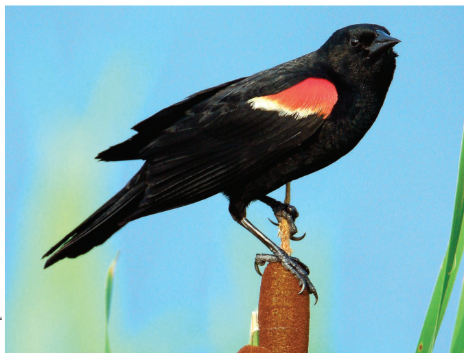
Male red-winged blackbird on cattail

of the month through the middle of June. The first broods of waterfowl appear.