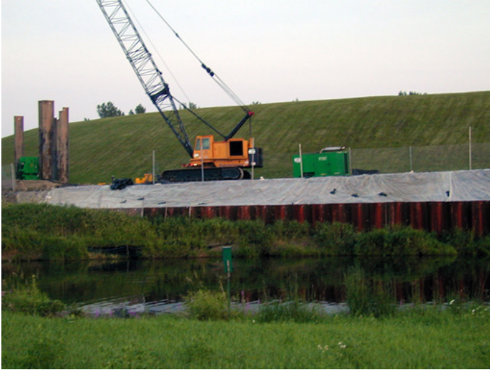
Turtle Cove prior to cleanup of PCB-contaminated sediments. The unlined 12-acre GM Landfill was capped with clay and seeded with grass.

Collecting natural resource damages is not intended as a “second cleanup.” Site cleanups focus primarily on eliminating or reducing risks to public health and the environment. NRDA focuses on quantifying injuries to natural resources and the associated service losses that remain after cleanup. Trustees can collect damages for injured natural resources and resource services from the time of injury until restoration is complete. Cleanup actions are not intended to address these “interim” losses.