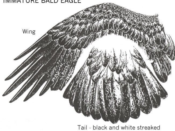
IMMATURE BALD EAGLE