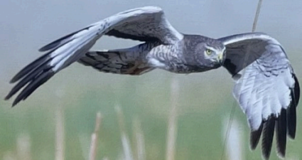
Northern harrier Aguilucho norteño

Remember, dogs must be on a leash and under your control at all times.