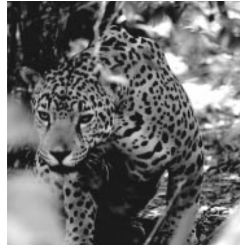
Because of its teeth, the jaguar has become a target in the shady business of illegal wildlife trade.

A U.S. Fish and Wildlife Service investigation of wildlife smuggling that sent a Florida businessman to prison for 40 months helped Federal authorities in Brazil break up a criminal network illegally trafficking in tribal handicrafts made from protected species.