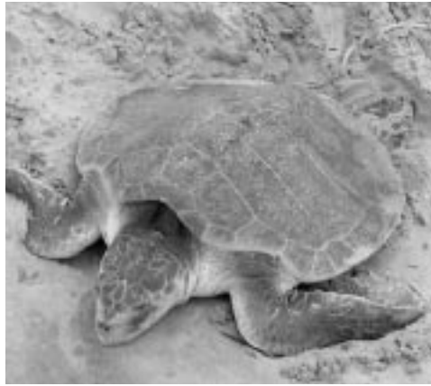
Nesting sea turtles contend with numerous threats including egg harvesting, poaching and habitat encroachment.

Sandra Cleva, Law Enforcement, Arlington, Virginia