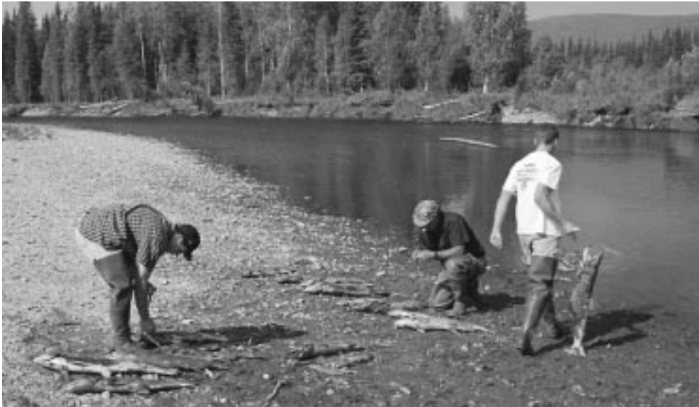
Carcasses of spawned-out salmon were tested for ichthyophonus.

Atlantic salmon in two New England rivers may have been exposed to a salmon virus as early as 1995, according to scientists with the U.S. Fish and Wildlife Service and the U.S. Geological Survey. The first indication of infectious salmon anemia virus in sea-run fish in this country was previously thought to be in 2001 when viral material was found in a Penobscot River salmon in Maine. The same year, the State of Maine reported the first confirmed case of ISAv in the United States in an aquaculture sea-pen salmon.