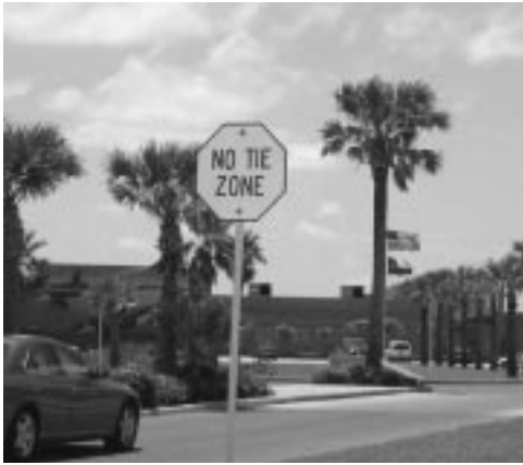
South Padre Island hosts the celebration in typical business-beach style.

The Service joined The Nature Conservancy and many other partners in May to celebrate the one-year-old purchase of 23,300 acres of barrier island habitat on the north end of South Padre Island.