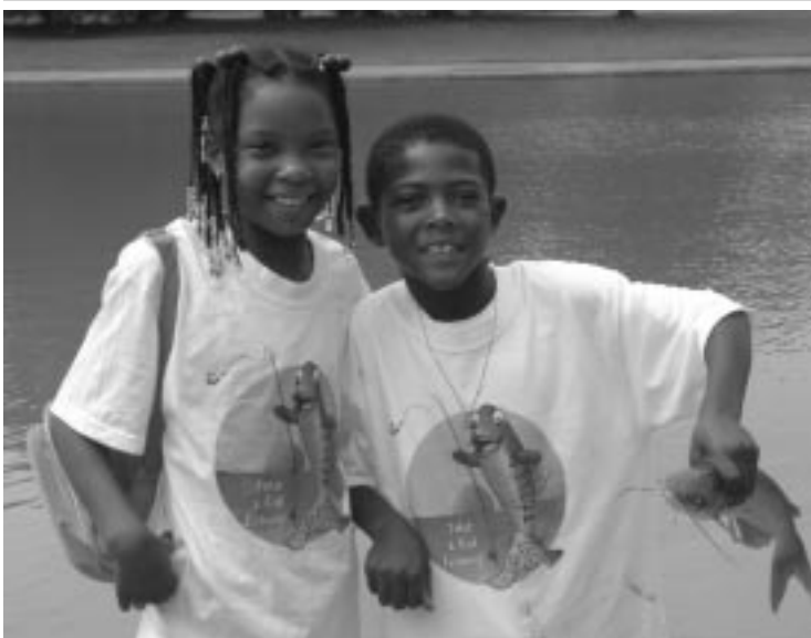
National Fishing and Boating Week, in June, introduces youngsters to the joys of fishing.

Based on the "Joint Venture" model, the Eastern Brook Trout Initiative is a key outcome of the Fisheries Strategic Vision and the draft Fisheries Strategic Plan. The Initiative will rely upon a collaborative approach to focus efforts and leverage resources to improve the status of this species on state, federal, tribal, and private lands from Maine to Georgia.