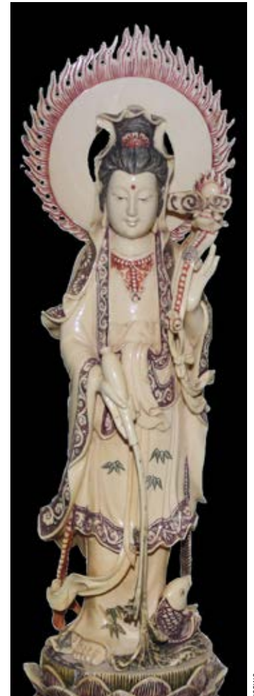
The Service confiscated this statue made from elephant ivory.

An often-heard question is “Why prohibit sale of items from long-dead animals?” Commerce in products made from wildlife that have been dead for decades can