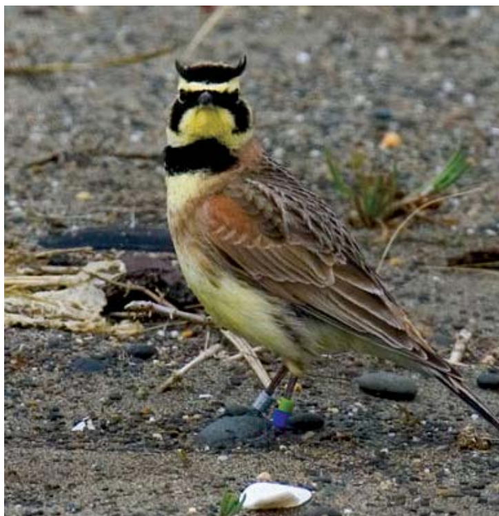
Rare streaked horned lark

presence of a nest,” and felt a buffer zone should be established, “to be mindful of the breeding site but still allow the work to be done.”