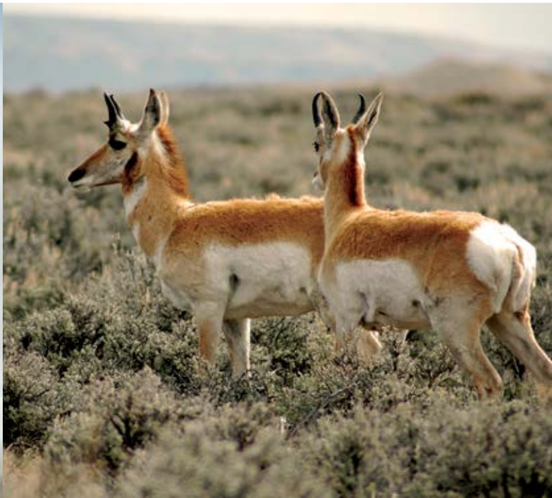
NFWF is working in Wyoming with others to protect the annual migration route of the pronghorn.