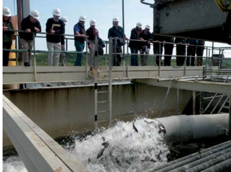
East Lift at Conowingo Dam provides fish passage on the Susquehanna River.