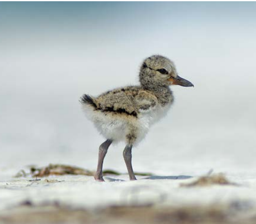
Based on projections from monitoring of nesting populations, the oystercatcher population, which was declining, has increased 4 percent in just 48 months.