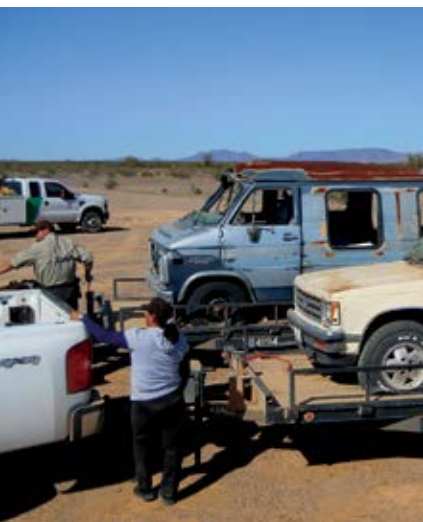
Border Patrol and refuge staff load abandoned vehicles for removal.

USFWS 31 abandoned vehicles onto flatbed trucks and removed them from the Cabeza Prieta National Wildlife Refuge and Wilderness Area.