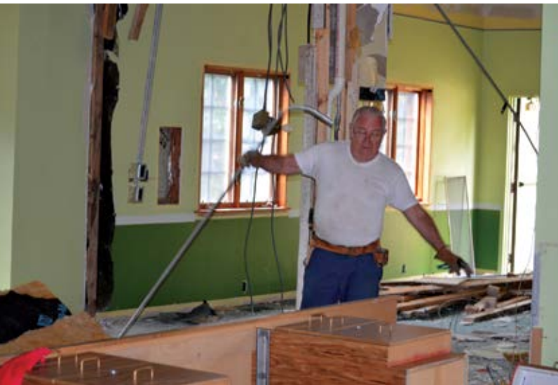
A volunteer For Habitat for Humanity removes conduit from the old Necedah building.

The goal is to have the building down before winter comes in 2012. The refuge is happy to be partnering and putting a different spin on recycling. The efforts are helping Habitat for Humanity and helping the Service remove a building at little cost. □