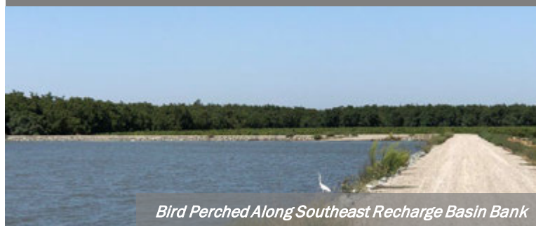
Bird Perched Along Southeast Recharge Basin Bank