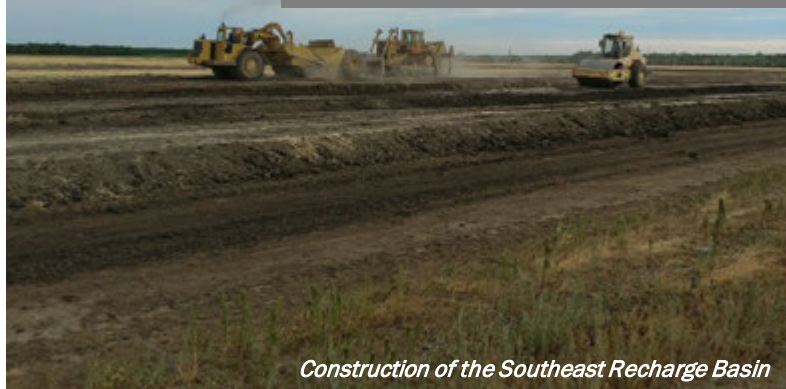
Construction of the Southeast Recharge Basin

In addition to providing groundwater recharge, the Southeast Recharge Basin creates seasonal wetland habitat for a multitude of birds, insects, and other animals.