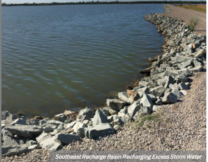
Southeast Recharge Basin Recharging Excess Storm Water