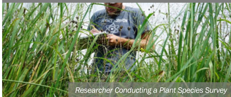
Researcher Conducting a Plant Species Survey