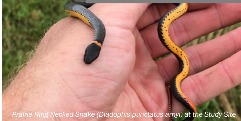
Prairie Ring-Necked Snake ( Diadophis punctatus amnyi ) at the Study Site

Researchers built on previous successes by seeding the study fields in the winter, in late January and early February, for optimum seed germination in the spring.