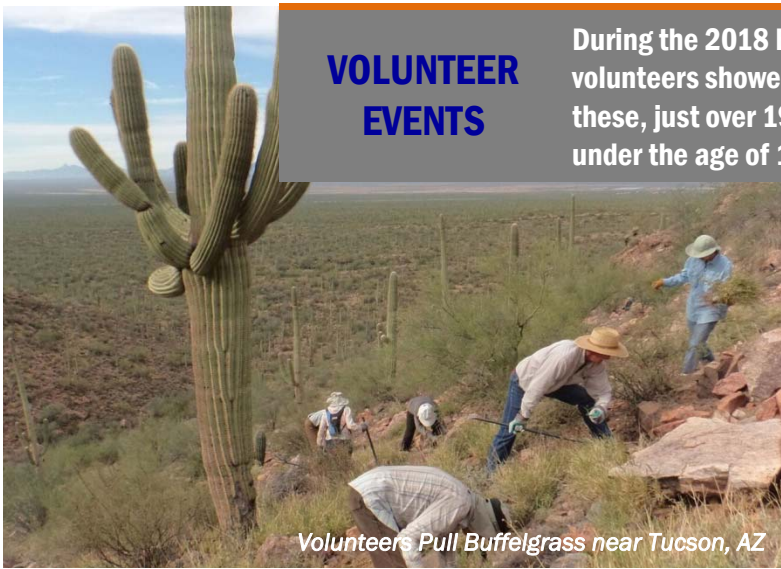
Volunteers Pull Buffelgrass near Tucson, AZ

During the 2018 Beat Back Buffelgrass month, approximately 450 volunteers showed up across 30 different sites throughout the month. Of these, just over 190 had never pulled buffelgrass before and 127 were under the age of 18.