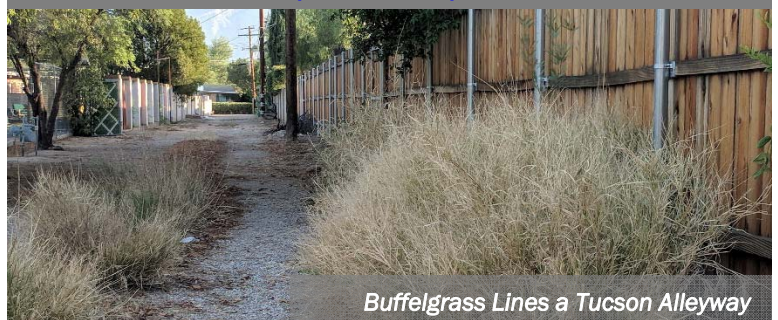
Buffelgrass Lines a Tucson Alleyway

For additional project resources and case studies, visit the Collaborative Conservation and Adaptation Strategy Toolbox: WWW.DESERTLCC.ORG/RESOURCE/CCAST