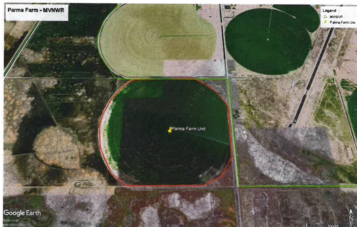
Parma Farm Unit - MVNWR