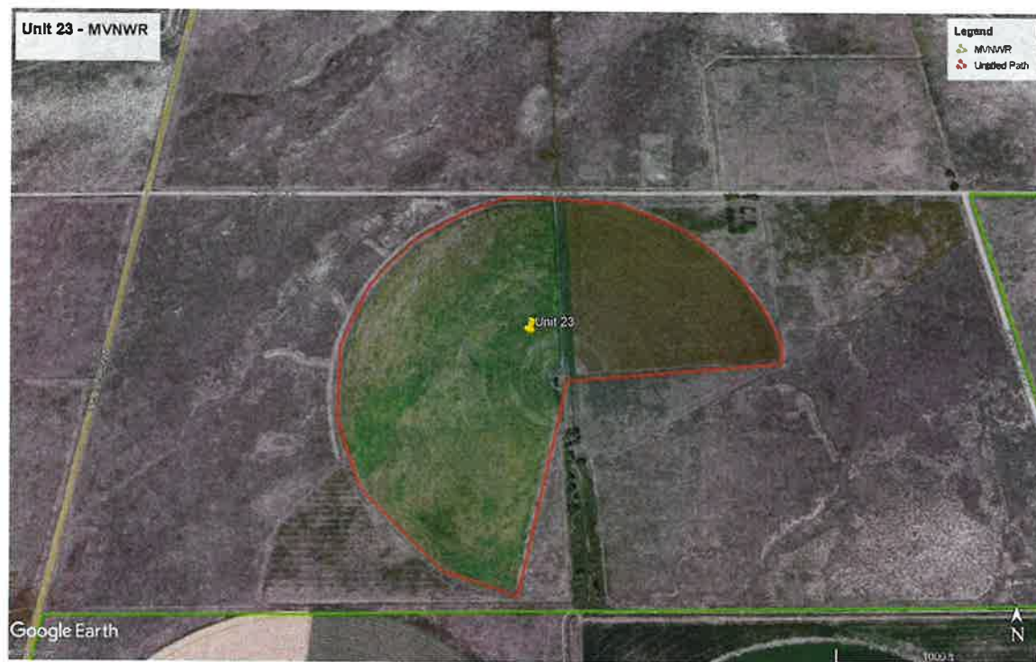
Unit 23 Farm Field – MVNWR