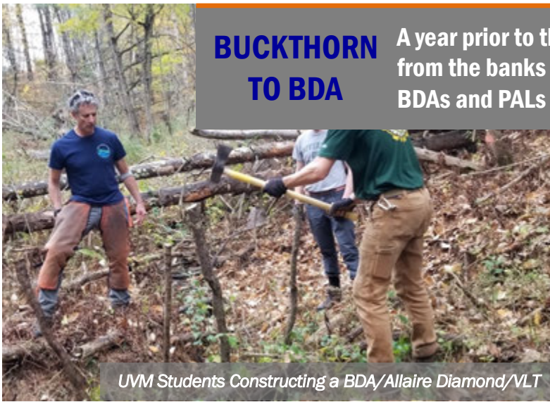
UVM Students Constructing a BDA/Allaire Diamond/VLT

A year prior to the restoration, partners cleared invasive buckthorn from the banks of Crooked Creek. This wood was used to build the BDAs and PALs installed in the creek.