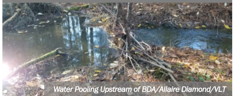
Water Pooling Upstream of BDA/Allaire Diamond/VLT

For more information on this project, contact Allaire Diamond: allaire@vlt.org