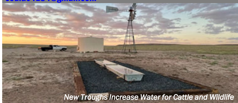
New Troughs Increase Water for Cattle and Wildlife