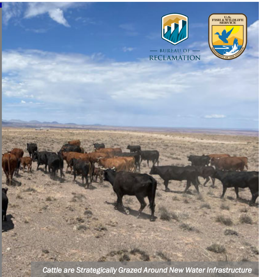
Cattle are Strategically Grazed Around New Water Infrastructure