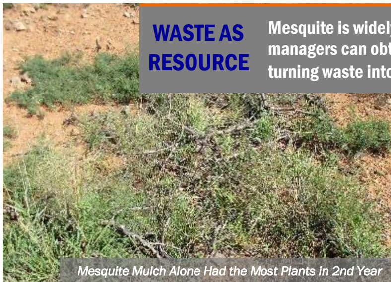
Mesquite Mulch Alone Had the Most Plants in 2nd Year

Mesquite is widely available in many arid landscapes. Rangeland managers can obtain mesquite branches from removal projects, turning waste into a valuable resource for ecological restoration.