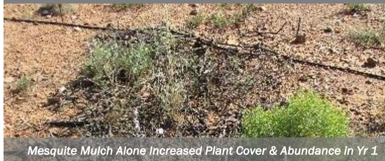
Mesquite Mulch Alone Increased Plant Cover & Abundance in Yr 1