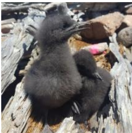
Guillemot chicks moments before banding.

While it is a bummer to say goodbye to two crew members, the rest of the crew was excited to observe International Guillemot Appreciation Day this past Friday. We celebrated by grubbing some guillemot burrows, measuring chicks, and banding them if they were old enough. Talk about some crazy festivities. As far as the other alcids go, we have some exciting news. After patiently waiting for them to grow, we finally were able to band our first puffin chicks. It is nice to see them get some big-boy feathers to cover up their down and hopefully they will start to fledge before we know it. We also had our first razorbill chick hatch, which we are all ecstatic about.