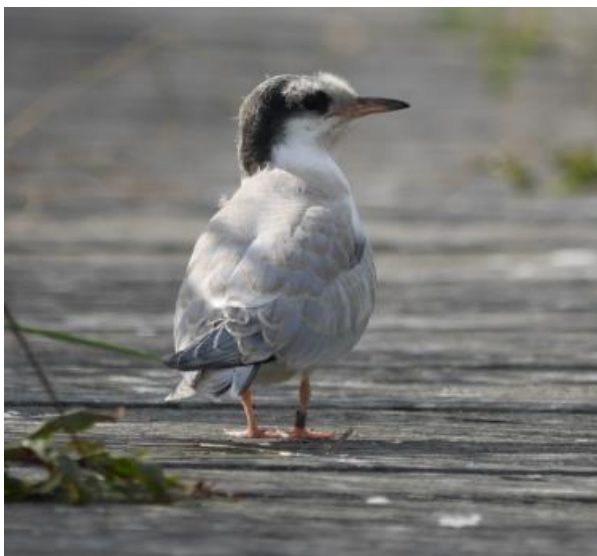
Common Tern fledgling.