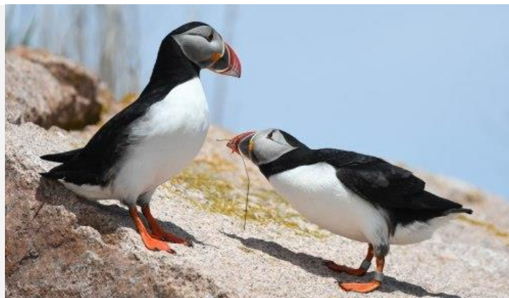
Puffin with nesting material.

The first week was somewhat slow on the island, but with each passing day it seems like we are getting more and more busy. The puffins are hard at work finding a burrow to call their own, razorbills are pairing up, a handful of murrets have made an appearance, and the guillemots come in droves every morning. The terns are certainly getting geared up for the summer as well. We are finding more and more of their nests every day. Overall I am very excited for the summer to progress and grateful to have an opportunity to work on this island.