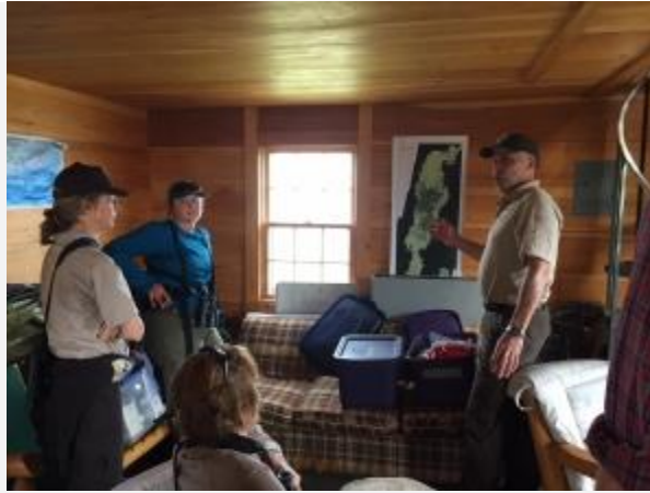
Great minds at work