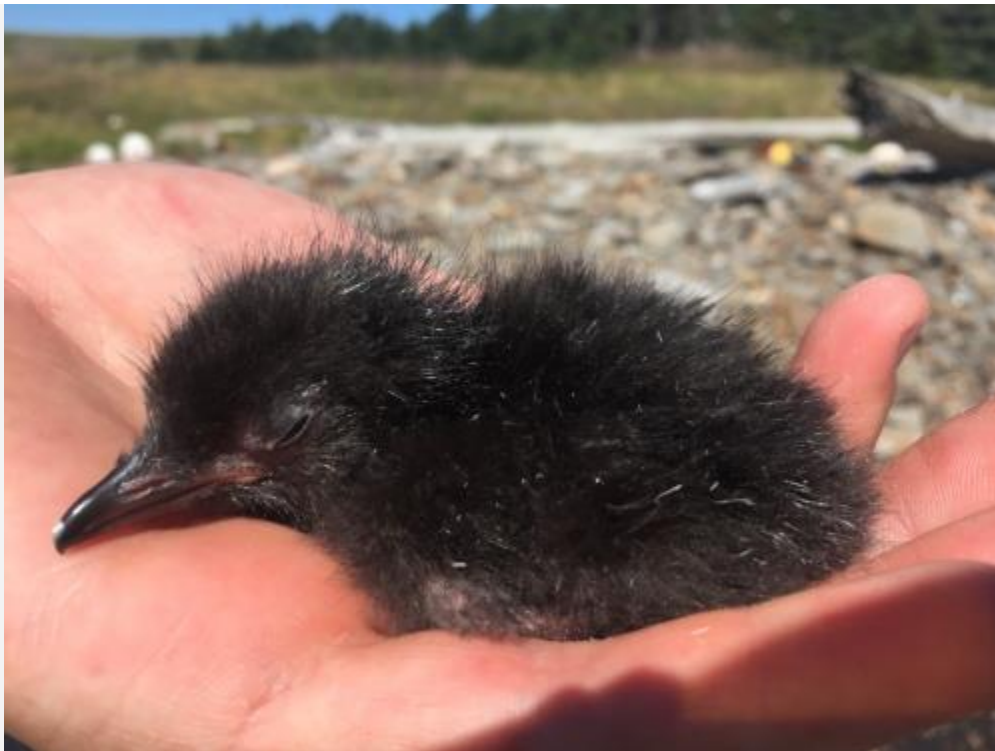
Black guillemot chick on its hatch day.