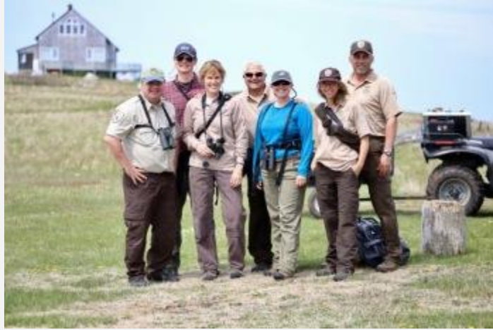
The 2018 Sheep Roundup Crew

Last Monday we, along with some much-appreciated help, set up nearly 0.5 miles of electric fencing to ensure that the sheep don't wander back over to the tern colony. Then next day, it was time for the sheep roundup! After some extensive planning and discussion, our team of 8 armed with walkie talkies, plenty of water and faith in our plan, headed out to restore peace to the north end of the island. After just two hours of mostly smooth sailing, we were able to herd all the sheep from the north end of the island through the fence and on to the southern end. After some well deserved high fives we wrapped things up by adding some brush and a few lengths of non-electrified fencing as deterrents in the inter-tidal zones.