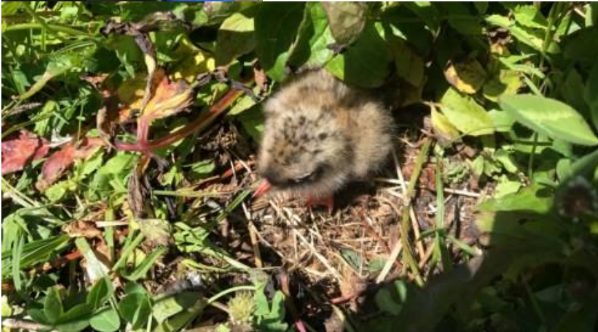
Pictures: Top L to R; Lance weighing a chicks, an Arctic tern chick, an Arctic tern chick sporting some new bands. Bottom L to R; Kate searching the productivity plot for chicks, a tub full of common tern chicks waiting to be weighed