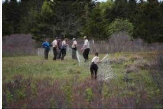
Setting up some of the non electrical fencing

However, sheep are curious and generally not the brightest of creatures. Last Thursday, while surveying the forest, we noticed that two lambs were caught in the non-electrified section of fencing we installed to dissuade them from entering the intertidal. One lamb was able to untangle itself, but the other was more tangled and had to be cut out. The lamb was uninjured and quickly joined its mother, but hopefully has learned to stay away from the fencing. Since then we've had no sheep incursions into the north end of Metinic, and we hope that is true for the rest of the summer!