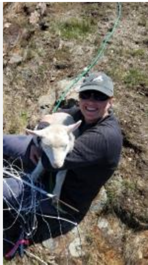
The rescued lamb!

Last Monday we, along with some much-appreciated help, set up nearly 0.5 miles of electric fencing to ensure that the sheep don't wander back over to the tern colony. Then next day, it was time for the sheep roundup! After some extensive planning and discussion, our team of 8 armed with walkie talkies, plenty of water and faith in our plan, headed out to restore peace to the north end of the island. After just two hours of mostly smooth sailing, we were able to herd all the sheep from the north end of the island through the fence and on to the southern end. After some well deserved high fives we wrapped things up by adding some brush and a few lengths of non-electrified fencing as deterrents in the inter-tidal zones.