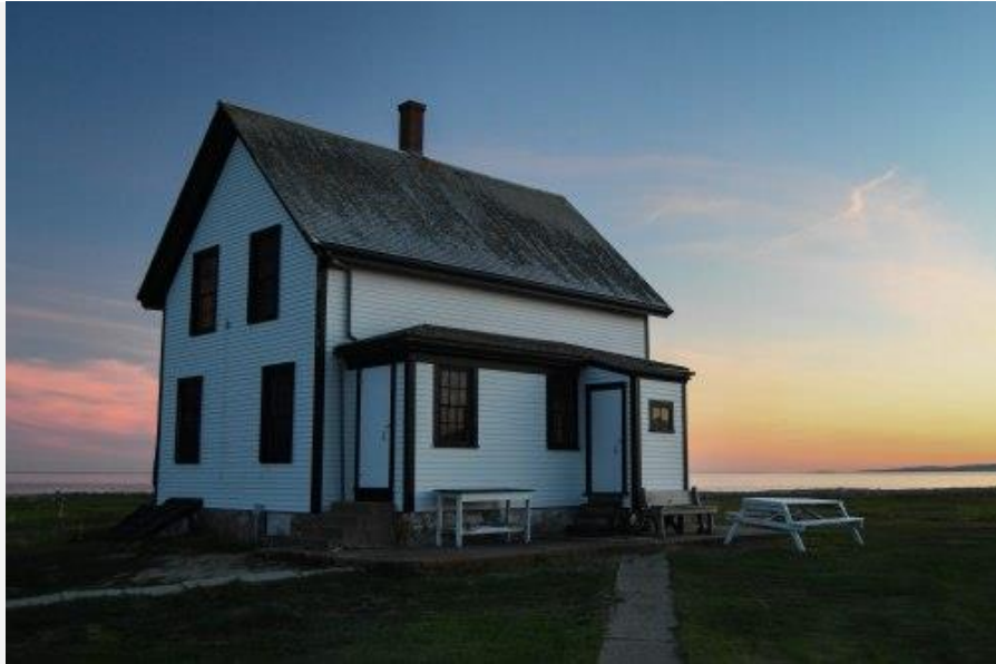
Our field house at sunset.

The island is a bit colder than I expected. The average temperature has been around 50 degrees which I am not used to in May. I have lived in remote places before, but not quite like this. PMI is only about 10 acres. It is definitely a unique experience living in a place that you can walk to every corner of in minutes. While PMI is a little on the cool and small size, it is proving to be a really neat place to live. The birds are fascinating and you can't beat the views from the lighthouse. I am excited to spend the summer here and hopeful that our cozy island will warm up just a little.