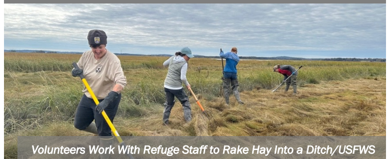
Volunteers Work With Refuge Staff to Rake Hay Into a Ditch