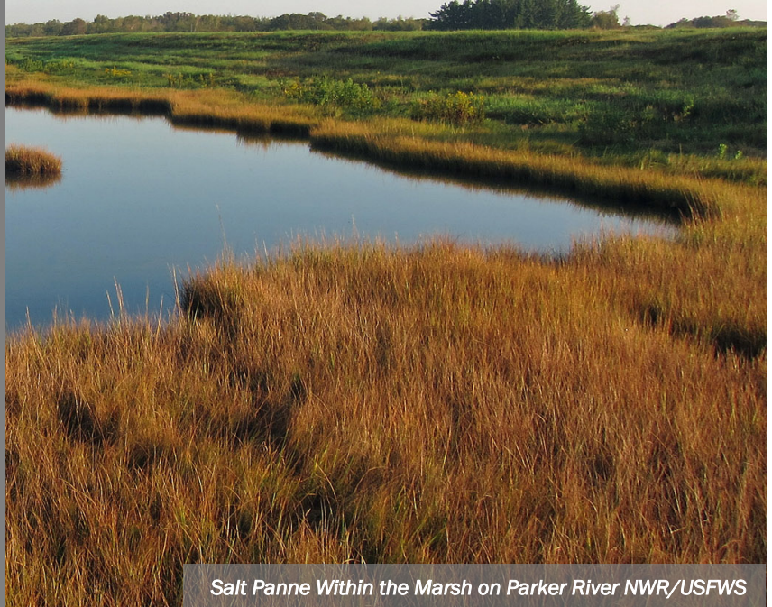
Salt Panne Within the Marsh on Parker River NWR/USFWS