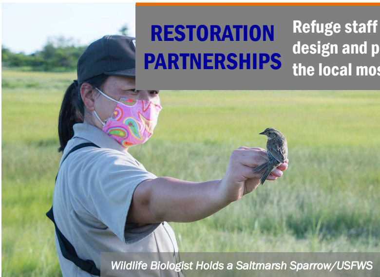
Wildlife Biologist Holds a Saltmarsh Sparrow

Refuge staff worked with academics and private contractors to design and plan the restoration. Specialized equipment from the local mosquito control district was used in the pilot project.