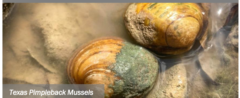
Texas Pimpleback Mussels