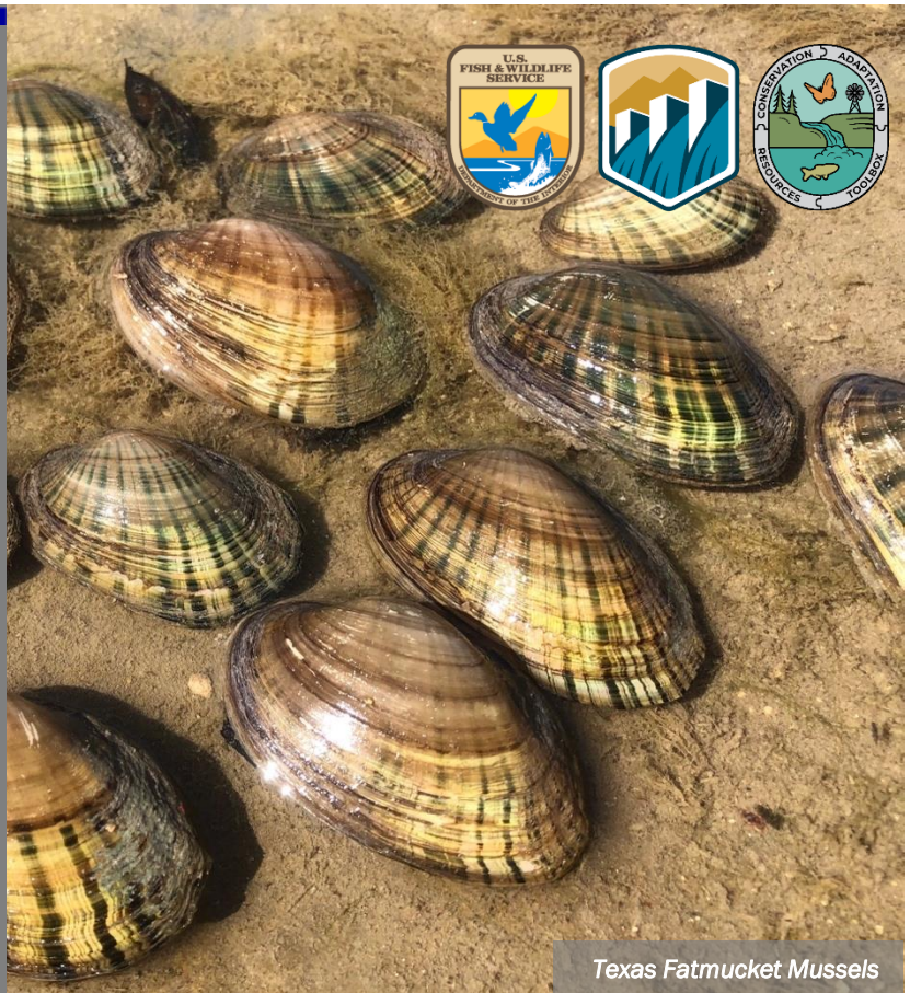
Texas Fatmucket Mussels