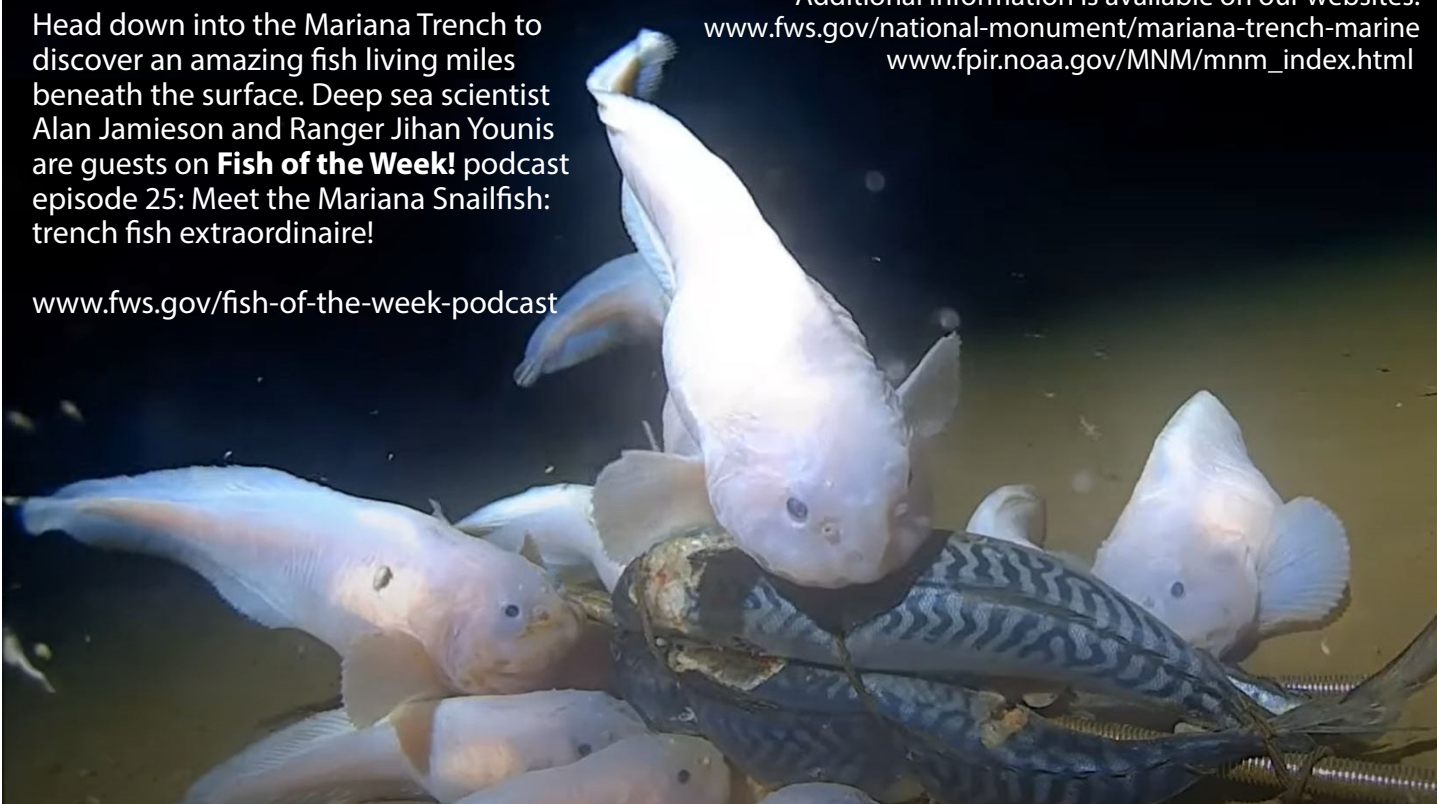
Mariana Snailfish feeding on bait over 4 miles deep in the Mariana Trench.

Additional information is available on our websites: www.fws.gov/national-monument/mariana-trench-marine www.fpir.noaa.gov/MNM/mnm_index.html