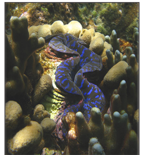
Giant clams at Maug caldera are colorful filter feeders on the reef.