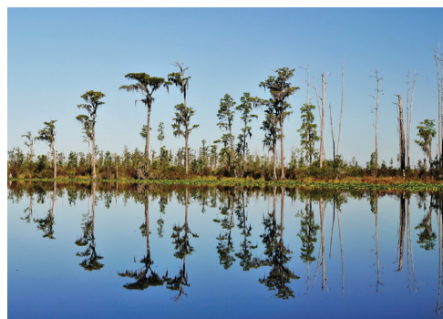
Top: Changes in hydrology could result in increased occurrences of wildfires in the Okefenokee Swamp.