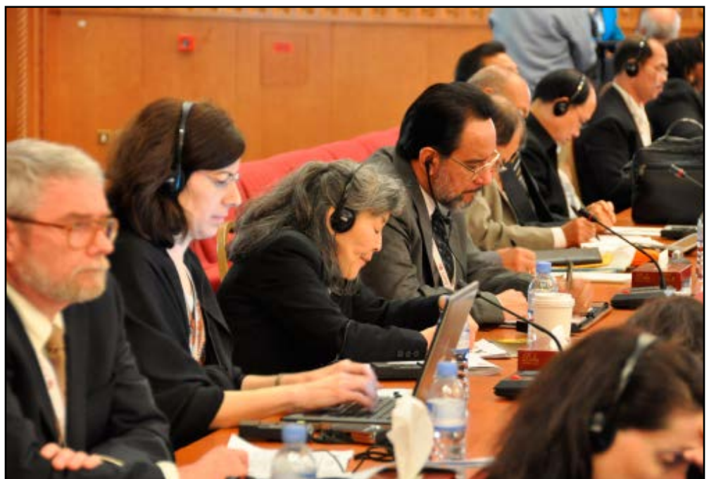
U.S. Delegates to a CITES CoP meeting participate in plenary sessions

Any Party may submit agenda items, proposed resolutions, decisions, and amendments to the Appendices for consideration by the Parties at a CoP meeting. Parties must submit them to the Secretariat 150 days prior to the meeting. The Secretariat, Standing Committee, Animals Committee, and Plants Committee may also submit agenda items, and proposed resolutions and decisions at a CoP meeting.