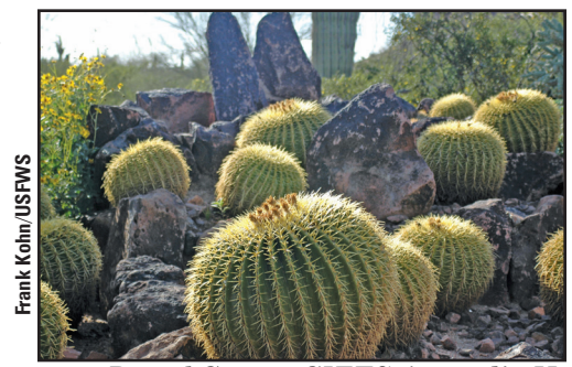
Barrel Cactus, CITES Appendix II

In the United States, the U.S. Fish and Wildlife Service is home to these two offices. Exporters must obtain a CITES permit from their national CITES Management Authority for each shipment that contains CITES-listed specimens. Export permits for Appendix-II specimens can be issued only when the following findings are made: