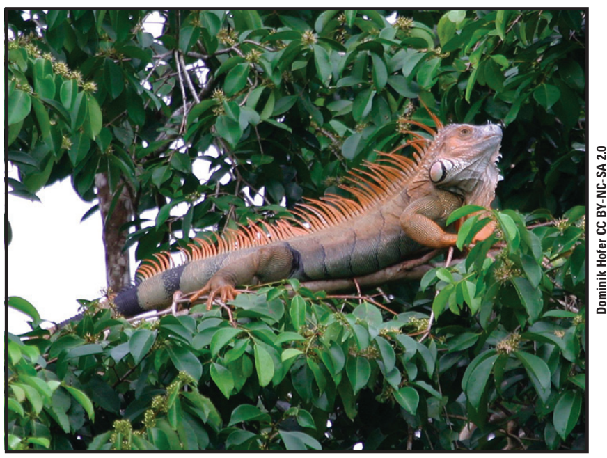
Green Iguana, CITES Appendix II

Assurance of long-term species sustainability through control of trade, and consumer confidence that species are being used in ways that are not harmful to their role within the ecosystem.