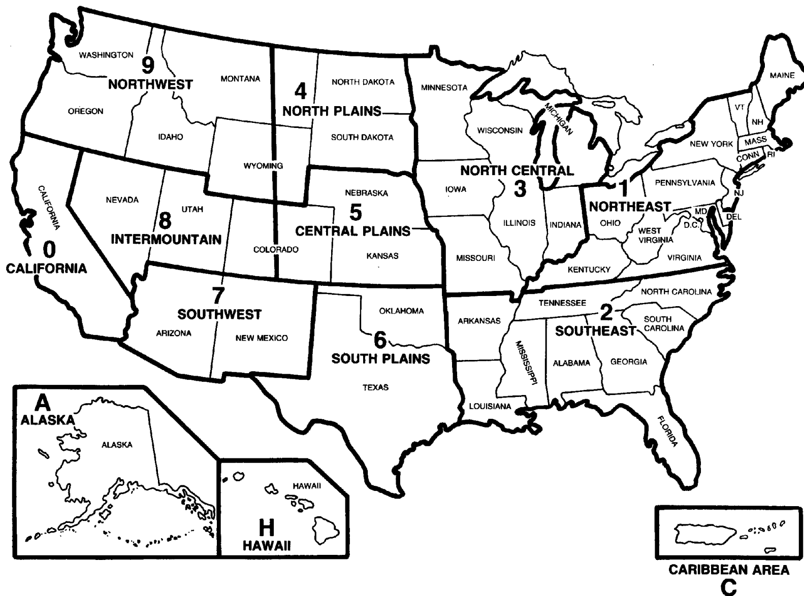
Figure 1. Regions of distribution for the National List of Scientific Plant Names (1982).